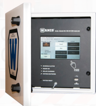
In-Cabinet Controller (location shown below)