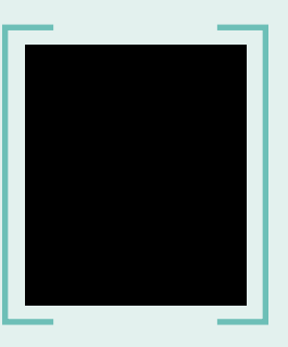
[Name] [Phone Number] [Email Address] [License Number]