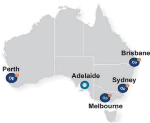
OP2 project locations