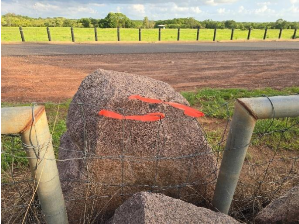
Hold the press, there is a cheque?