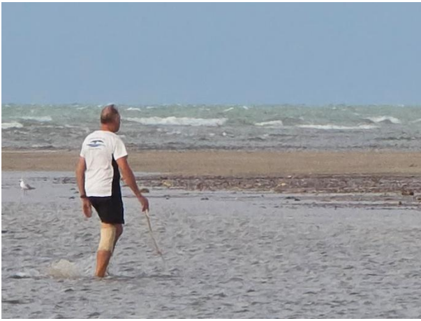
A/GM Gropa leading the shiggy crossing