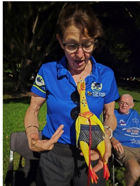
The energised the chook with chakra diamonties energy after being cleansed for 45mins in the Miele front loader in silience with a clunk every now and then. Lost its squarrk with the great grand kids attack.