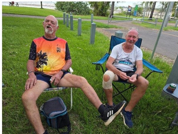
Saint Physio wabbling his 5 th leg in sympathy too