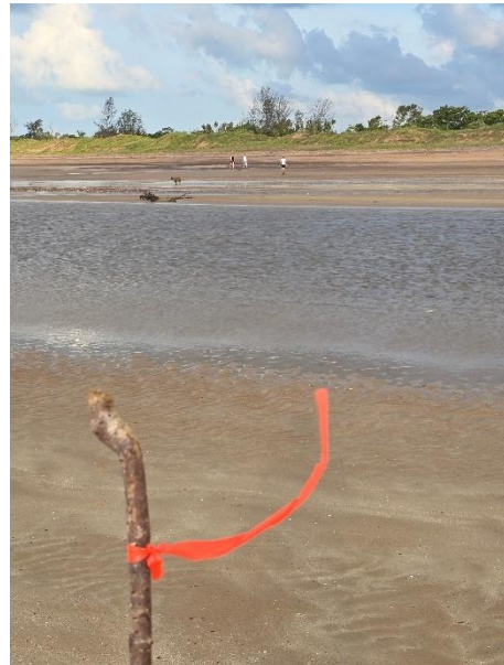
What is the wind strength aviators??