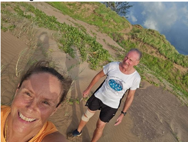
Up the sand dune we go!