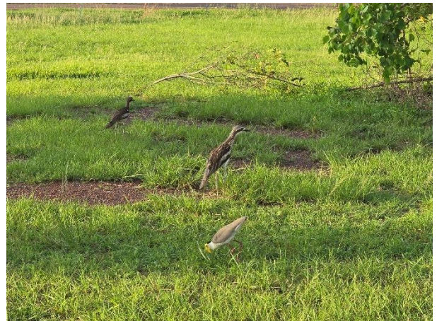
The pack of curlews and plovers obstacle