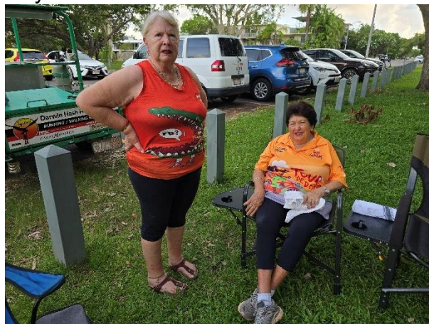
Where is the champagne?