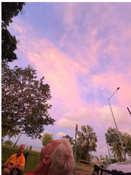
Cricket admiring the moon and Lighten Up sky