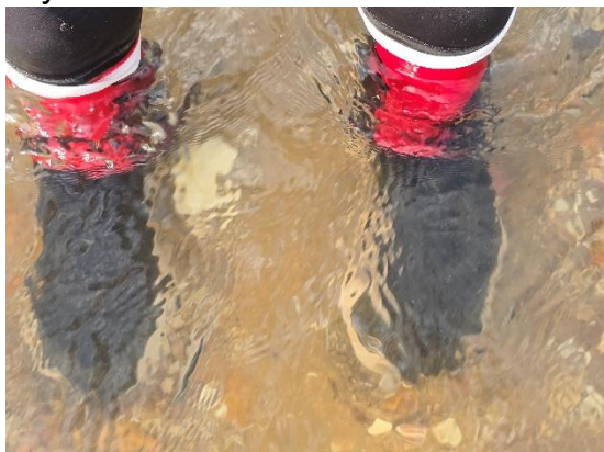
Ankle deep, for some shin deep