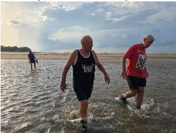
Braving the crocs