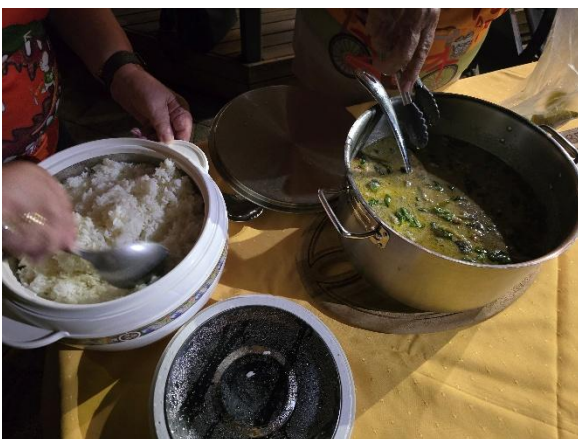
Nosh – green curry and rice – Yumo!