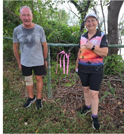
The falsie that was mis interpreted/misplaced for ON HOME