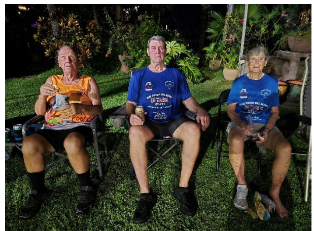
OBE Pickles and Oops – stunned mullets