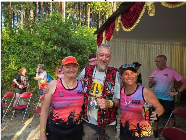
We found Turn Your Back too! DH3 reunion