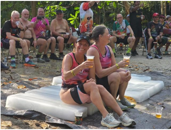
Fined – BackPage & Roxby for 9 minutes of cuming on the bus! Scredriver from Hammersley Hash was jelous!