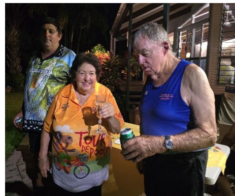
The Hares serendaded to Shitty Trail