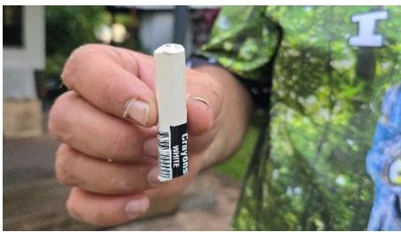
White crayon to outlast the rain