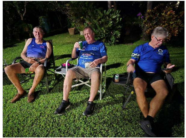
Barbwire, Boots, HIV – new entertainment