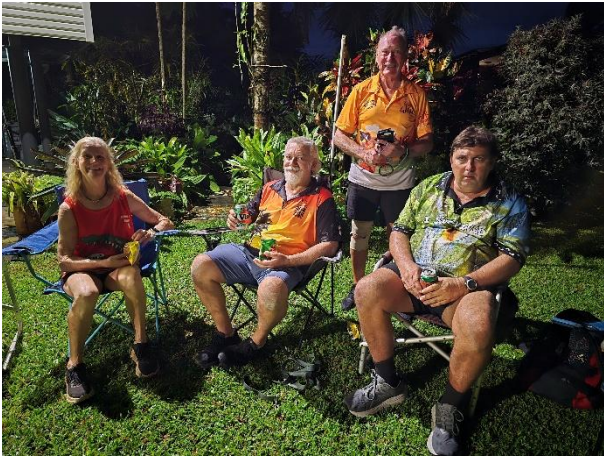
Sexon, Full Bottle, Gropa & Tow Job