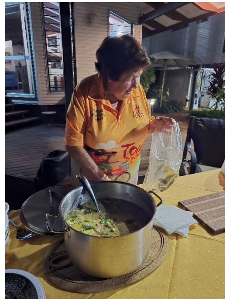
Plenty for second on the flavoursome green curry. Thanks Guest!