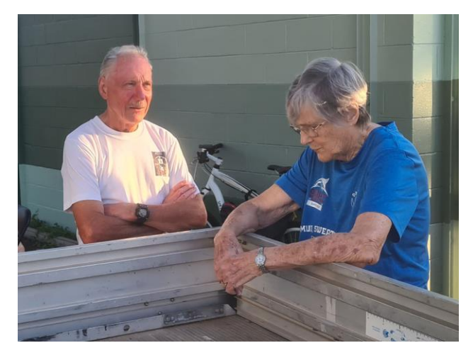
Gropa and Oops discussing Trumps latest Tariffs