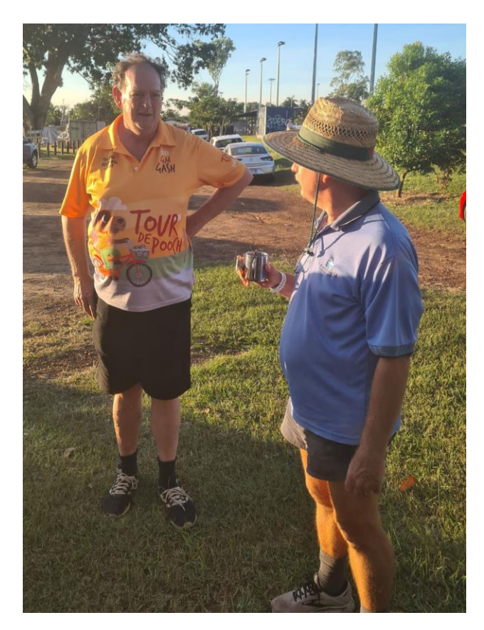
New GM Ricemaster and ex Scribe HIV