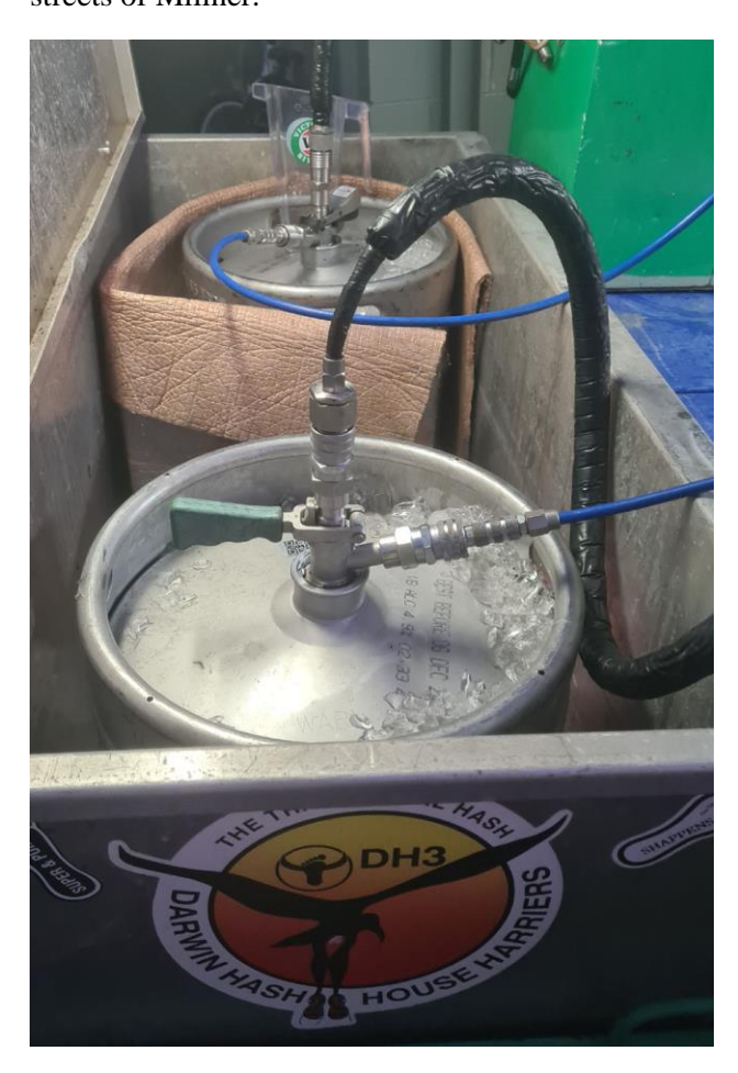
The kegs pouring perfectly

New Hash Scribe, Backpage RSM, buggered off into the sunset to teach little people how to be Soldiers. Consequently, poor old Physio has had to do the Sheet for tonight's run. Including the late arrival of Barbwire and Guest, we had a pack of around 21. Leftover kegs from the AGPU were pouring perfectly. At precisely 6pm, new GM, Ricemaster sent us off on Orange tape into the sunset. The new GM endeared the pack by setting a very short post AGPU run of 1.57km through a few streets of Millner.