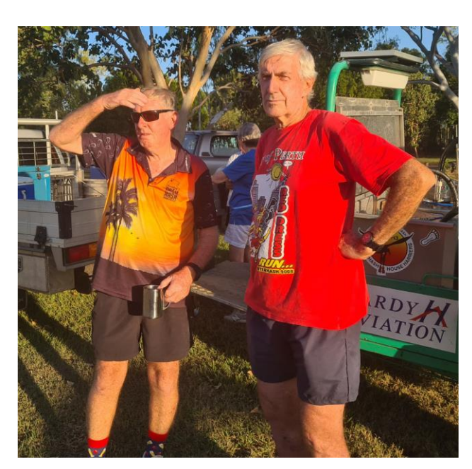
Gash and Cricket surveying the run.