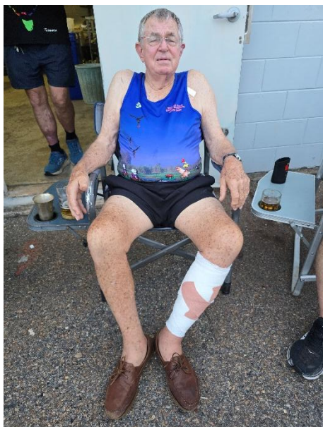
More bits cut out of his leg this time