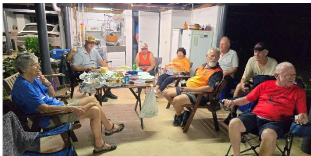
The nosh gone so quickly