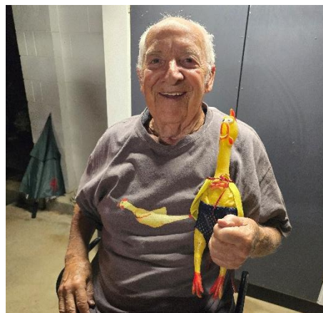
Minute Man and swkarrky

After winning the chook a second week, HIV and the chook discussed fining the one who made him squarkcum twice, so Minute Man is the new Chuuk. All of a bingtang sundown the chook cum alive....sqarrk