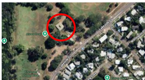
Alawa Hall, Lakeside Drive Alawa