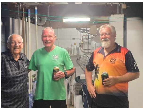
Minute Man, Gropa & a chip off the old shoulder Fullbottle