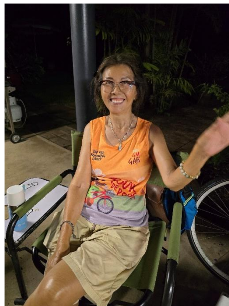
Enola great spirits