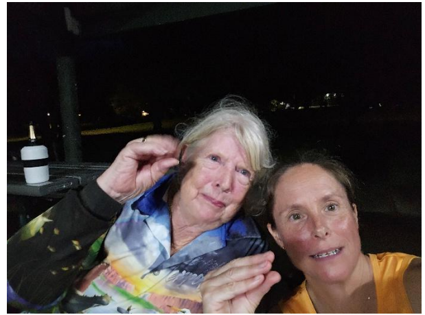
Chicken dance, calling the chook