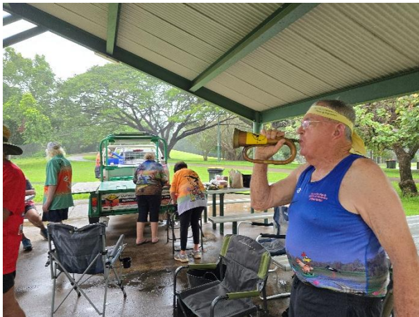
Barbwire Hash Horn