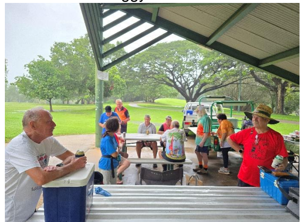
Loving the pergola when then sky opens