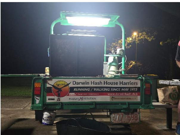
The valuable DH3 trailer