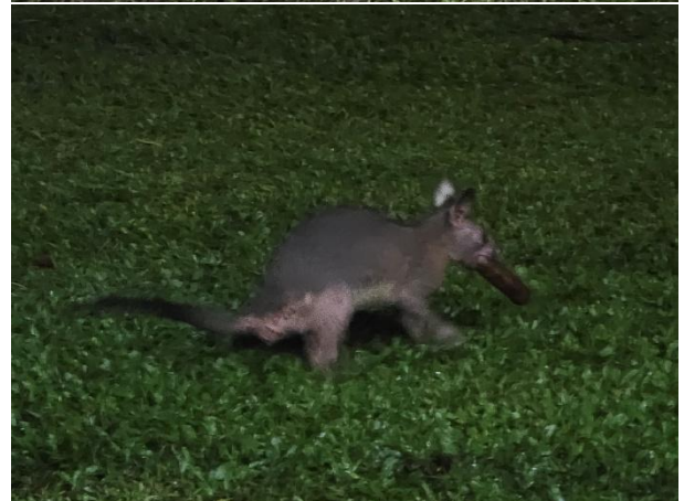
Our hungry possum harrier