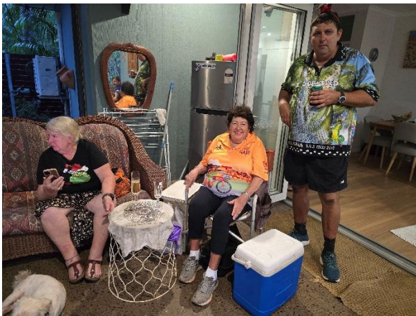
Look over there!