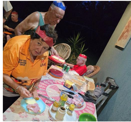
Ham sandwiches and condiments