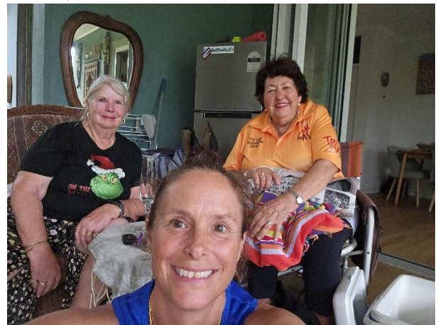
The esky minders club