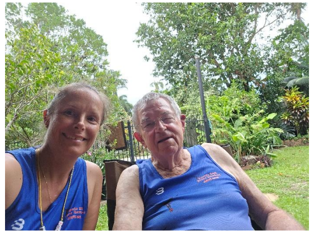
Happy sailing thoughts