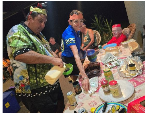
Mature pudding and custard