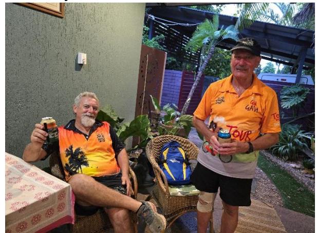
The yeti is missing, cheers!