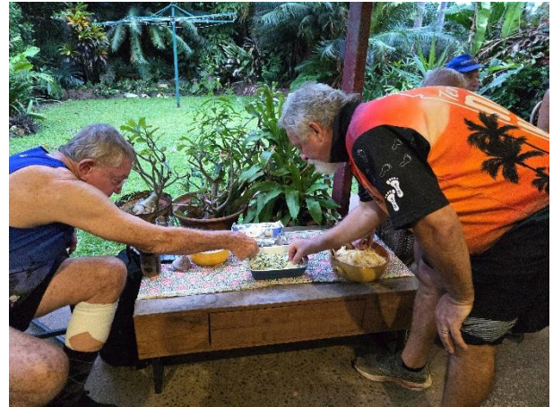
Quick, whos in first....artichoke wars