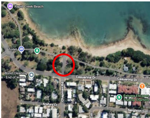
End of Chapman Road Park

Monsoon rain alternate option will be at the rotunda on the other side of the Rapid Creek Bridge