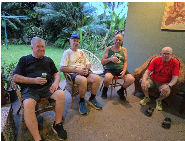
Cricket, your stubby cooler is being hash minded by BackPage, till next week