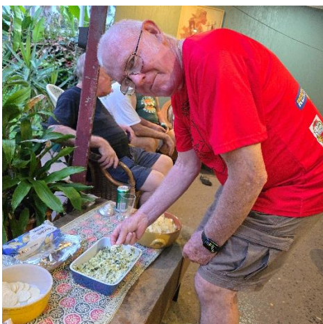
Artichoke and spinach dip