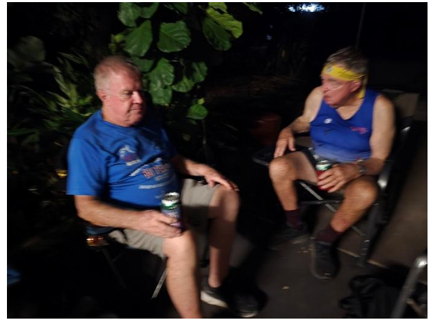
The earth moves!