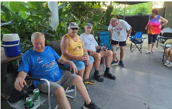
Working up to a walk