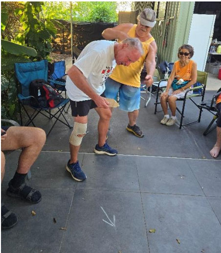
He host knocking the hare for grafit!