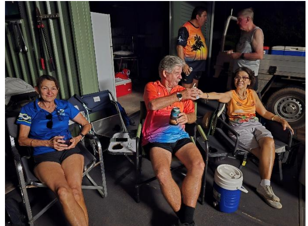
Come Again is back on the wagon