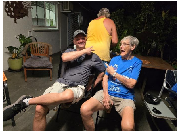
Measuring up for an Animal Brazilian