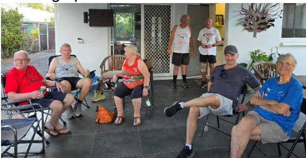
Its not raining!