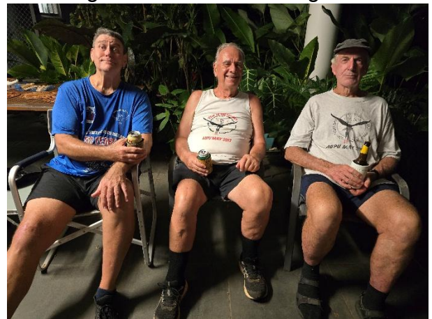
3 blind mice, no, the 3 amigos!