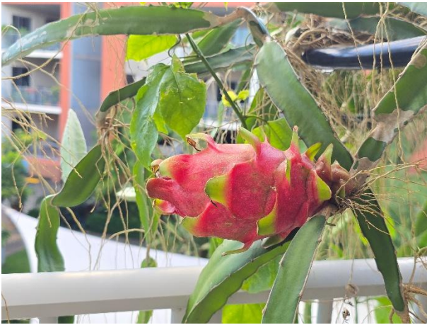
BackPage's dragonfruit is almost ready!