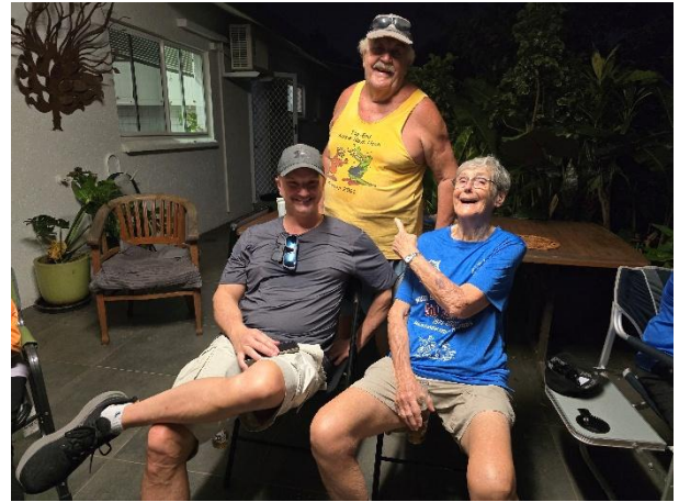
That's the spot