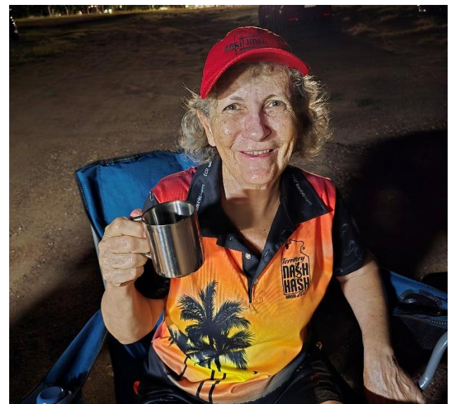
Ruff Red , so good to see you again serenaded to She's a Piss pot and helped the hare run the pissss sopt