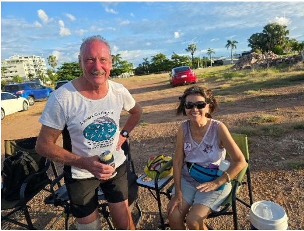
GM Gropa & Enola