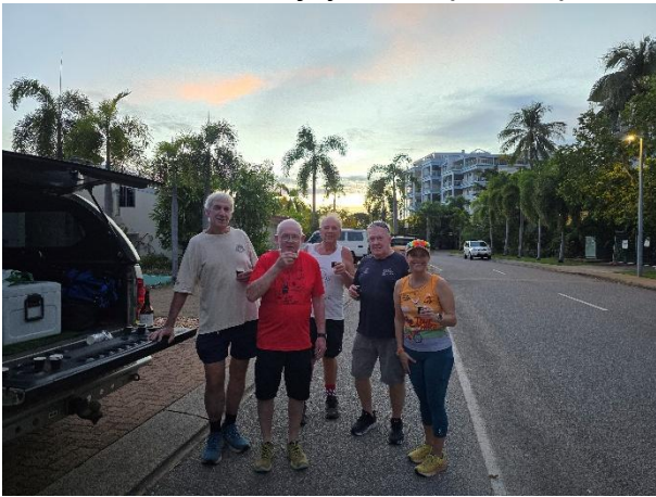
Piss sopt of a sailors sip, nip of Club Port