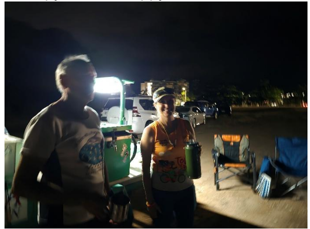
And the hare is havin a b'day on ANZAC Day