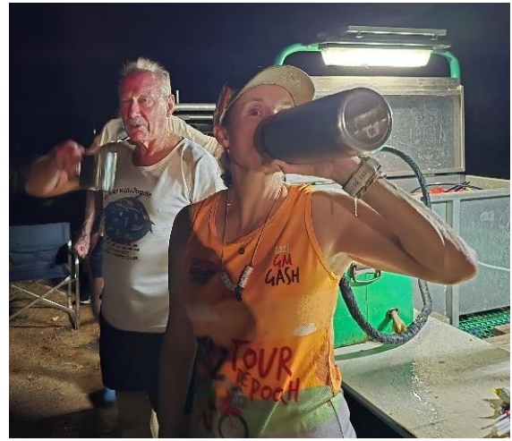
BackPage On On the hard stuff