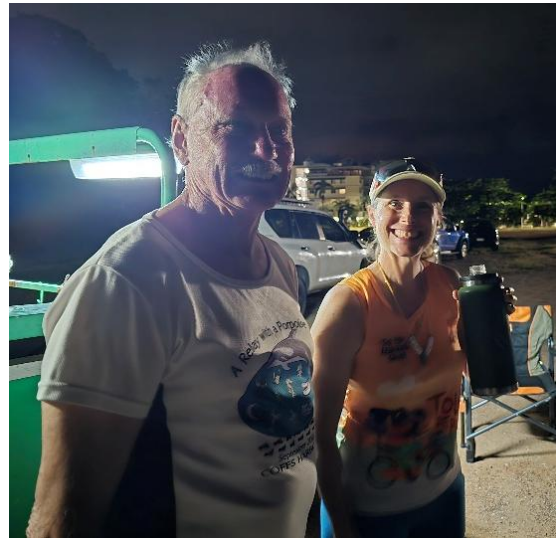
Serendaded to Hare BackPage to Shitty Trail with ice in the bra