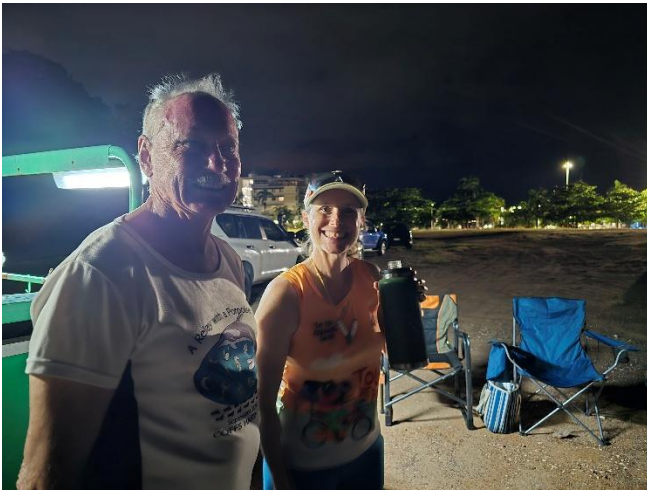
GM Gropa & Hare plus Scribe BackPage