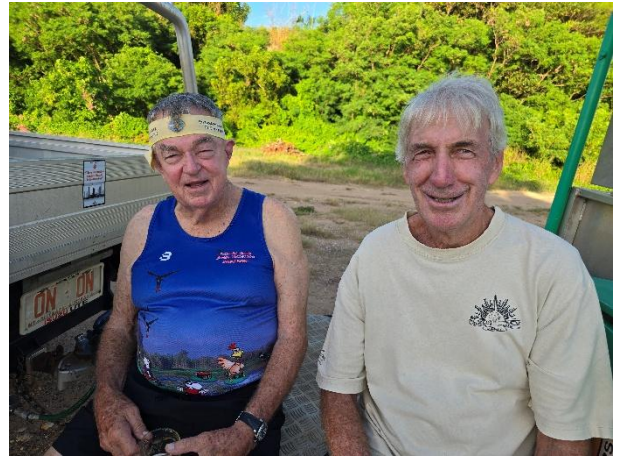
Grumpy o'l men happy?