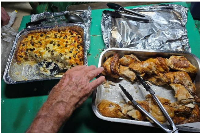
The Thing hunting food

Nosh was entree of spinach and artichoke sourdow cob loaf dip, followed by French potato and BBQ chicken licken and for those Dr Whooooo stayed long enough a mint slice chaser. Even Enola went back for seconds!