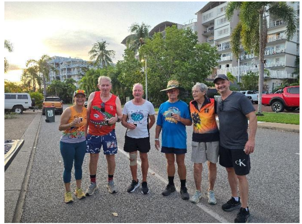
More piss sopt, a few sailors in the wind