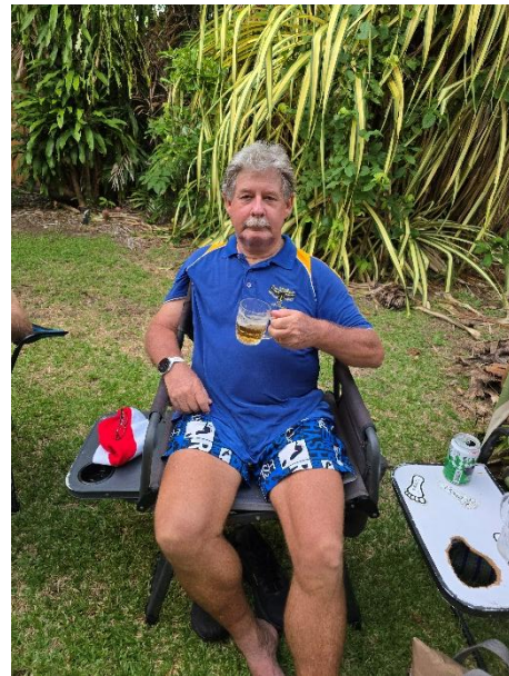
And the keg is pouring beautifully