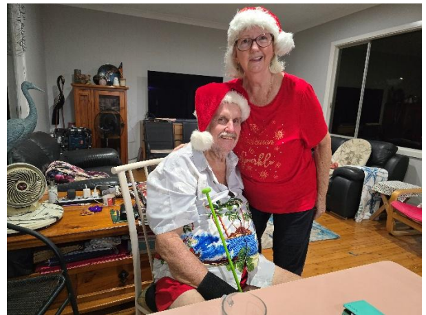
Lighten Up and Dibba Dobba happy to see their hashy family again