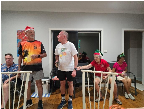
A/GM & A/Choir Master at it (ohh la, la)