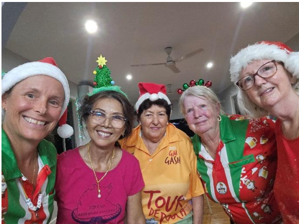
We wish you a hashy Christmas