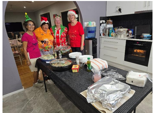
The amazing chefs