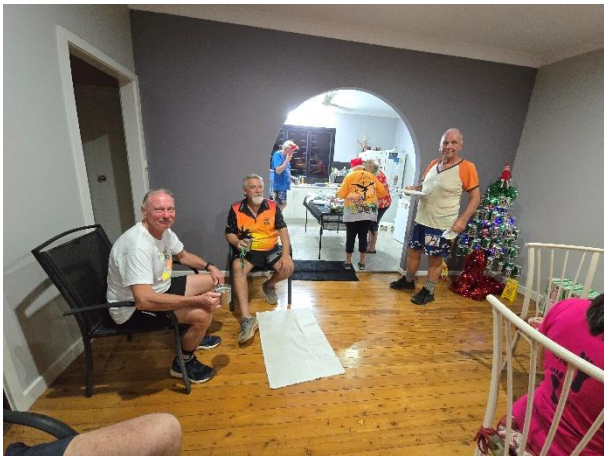
The other blokes