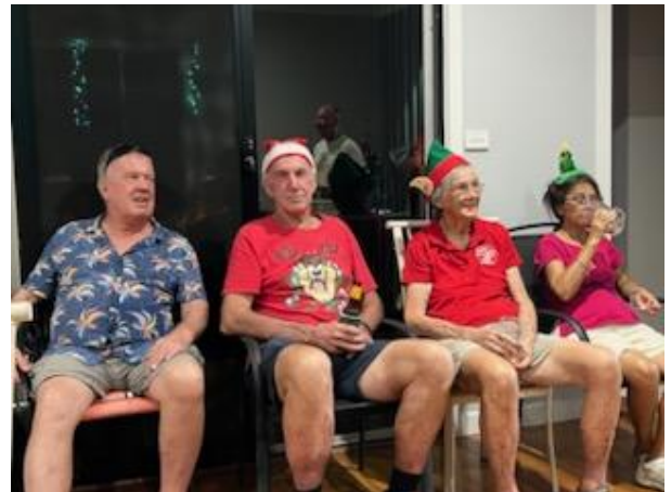
Someone is paying attention