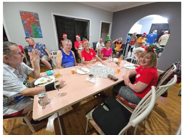
Full after tasty nosh, making room for dessert