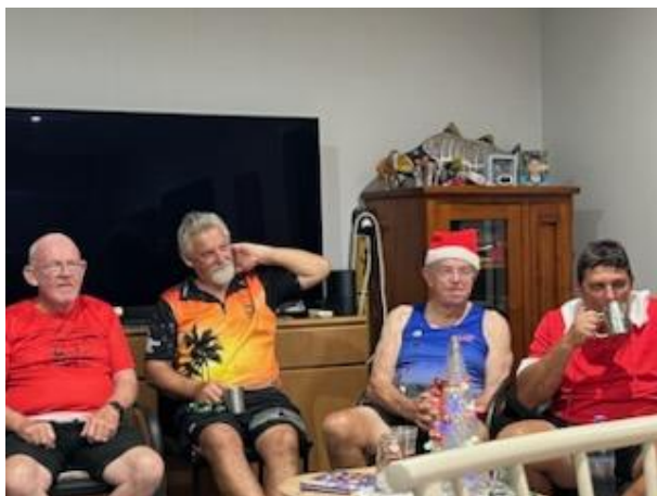
Mixing it up