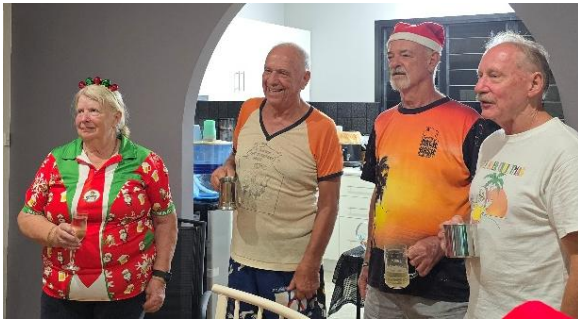
Hares Jensett & OBE serenaded to no coitus