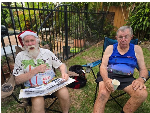
Monkey is back again, What??