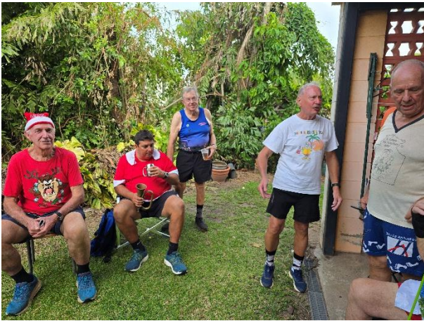
Merry hashers before run