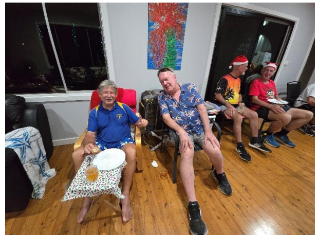
Is mischief hanging around?