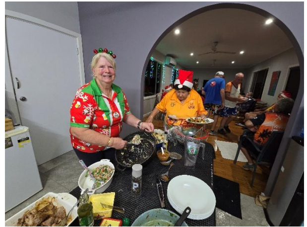
My turn to serve nosh