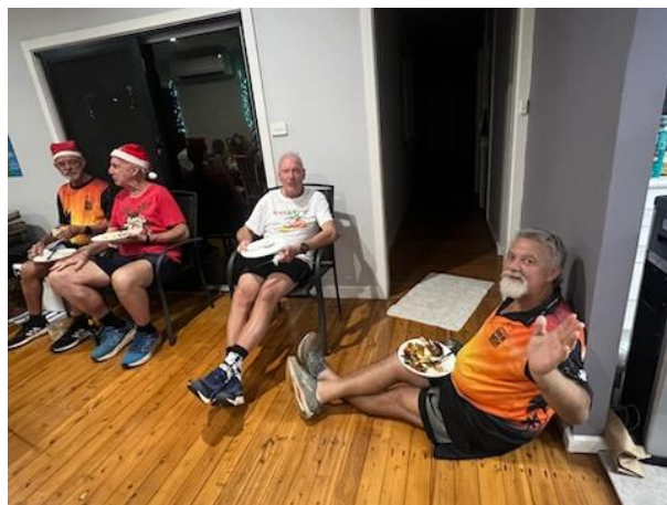
Floored for the team