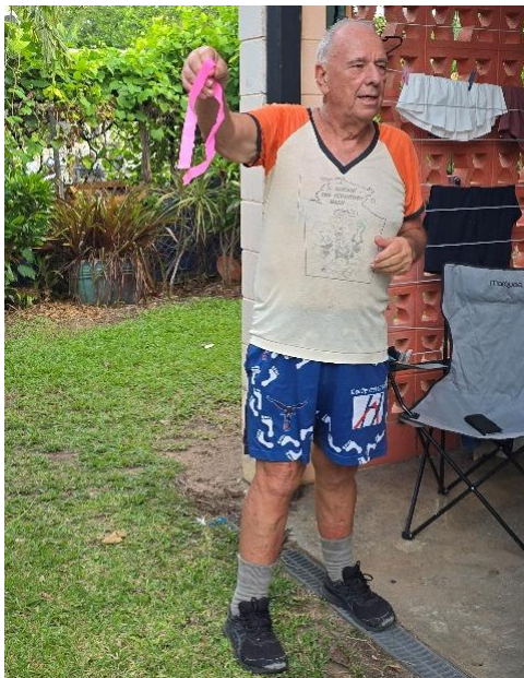
Pink bits and white chalk

A/GM Gropa rallies the 21 merry hashers some dressed in Hashy Christmas gear ready to hear the trail of destructions from OBE .