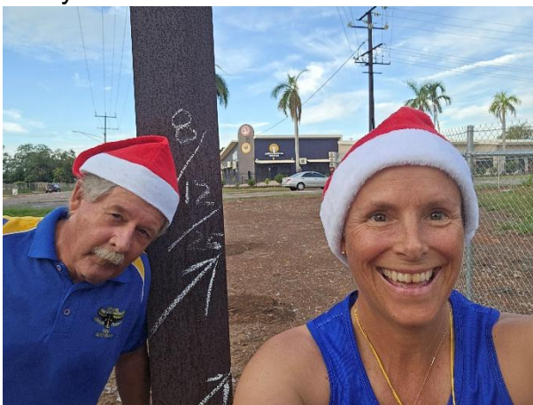
Fractions on trail??