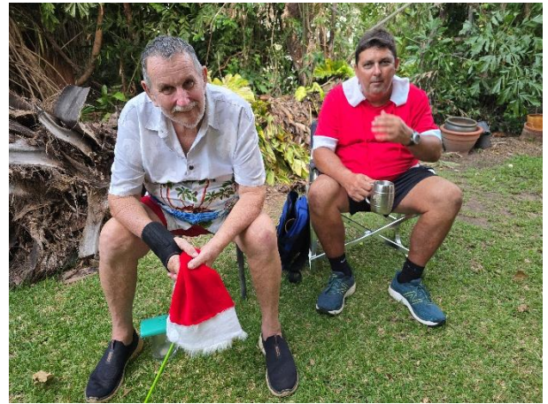
Happiness amongst hash family