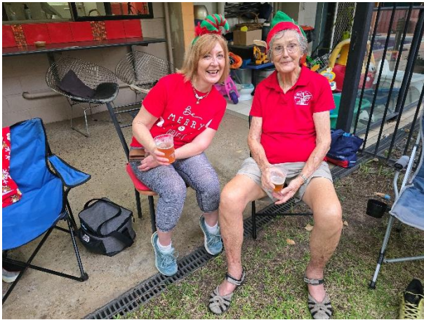
More double trouble