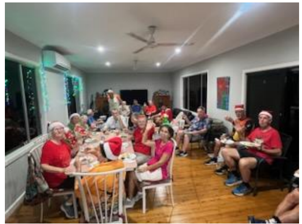
DH3 hashy family