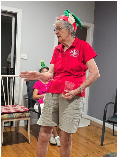
Oops story continues