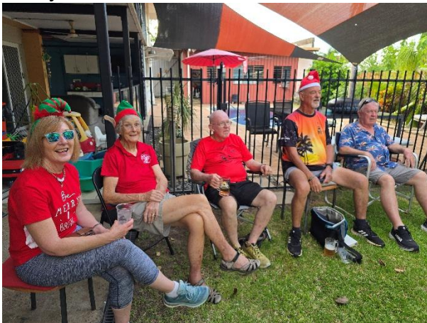
Merry hashers before run