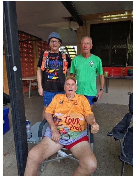
Lighten Up with Chew Caca, Gropa