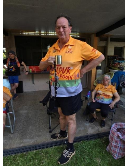
GM showing us how its done