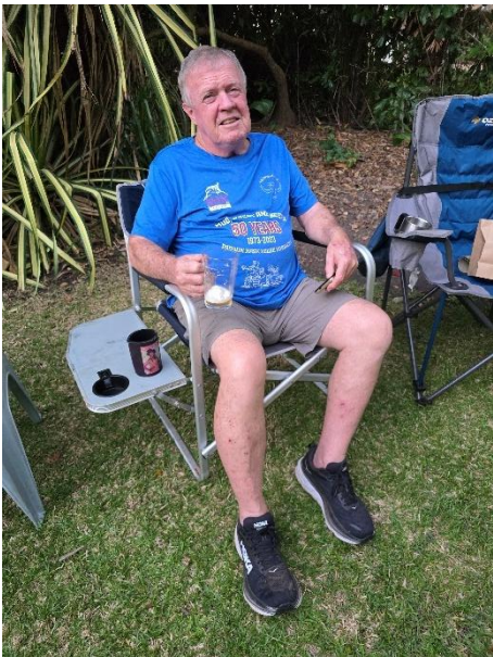
Concrete Boots set in place