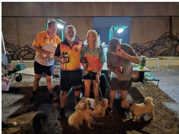
The FullBottles clan, charged by OBE for