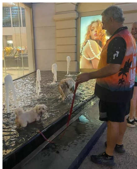
Who's the culprit? Doggone!

Fullbottle fines Sexon for pushing dawggie in pool, caught on all cameras, then my little dog got pushed in. No fine in the end! (bullshit song)