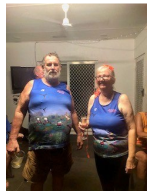
Guilty as charged