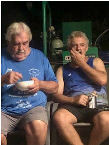
GM Im done