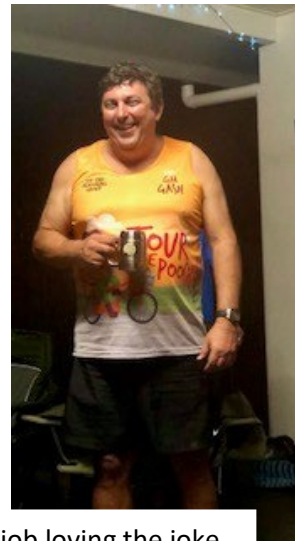
Towjob loving the joke