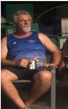
Looking over his flock