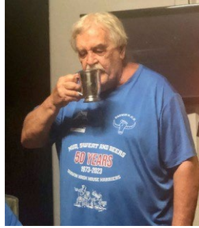
And the Hare