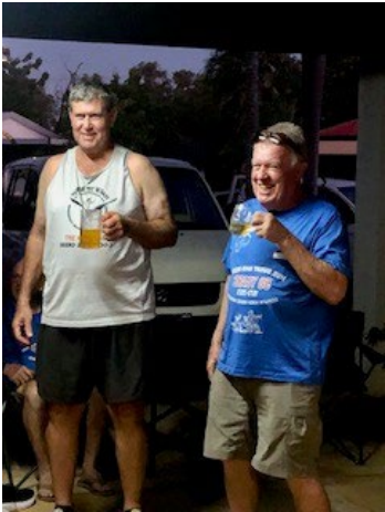
They did something