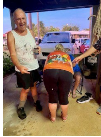
The hole – shame job