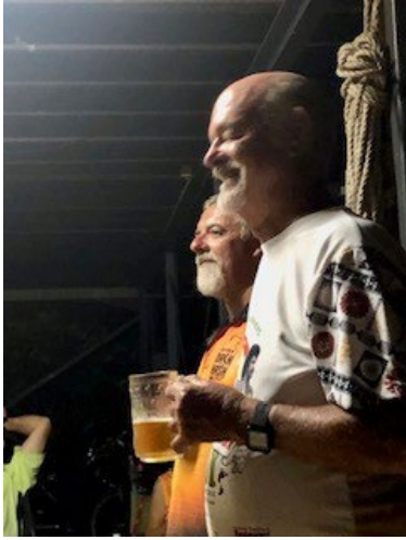
And the Hare