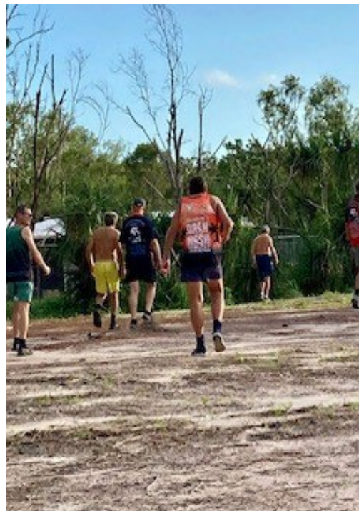
Rear end of CH3-best view ever

Sir Animal, a Shanks run, Red I believe. #14. 🦜🐔. Be there.