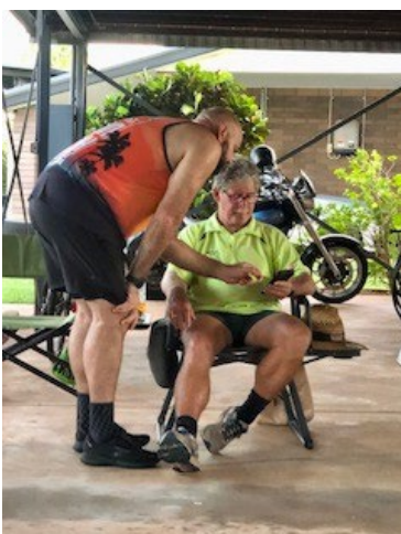
Joining phone forces