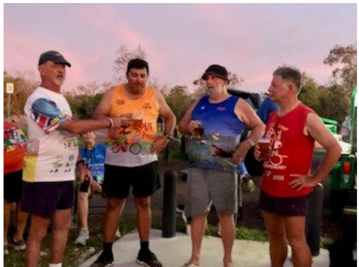
All guilty it seems