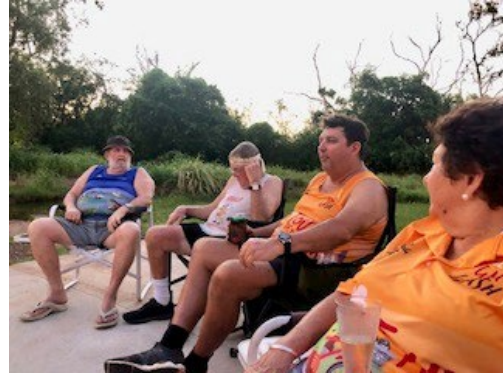
More of the mob