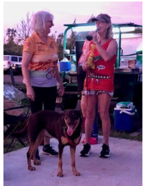
Dibba dobs on Kendrick for peeing on Barbwires bag