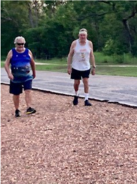
Barbwire finds stray Animal