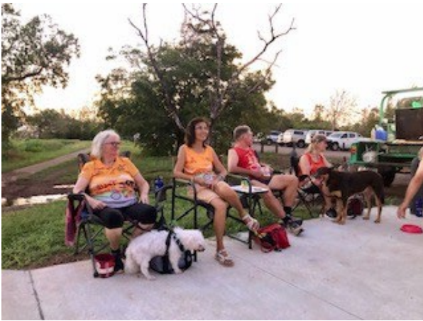
Waiting for the on on