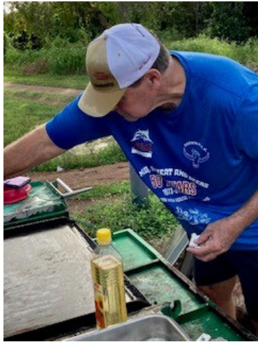
And the Hare -Cooking Preps