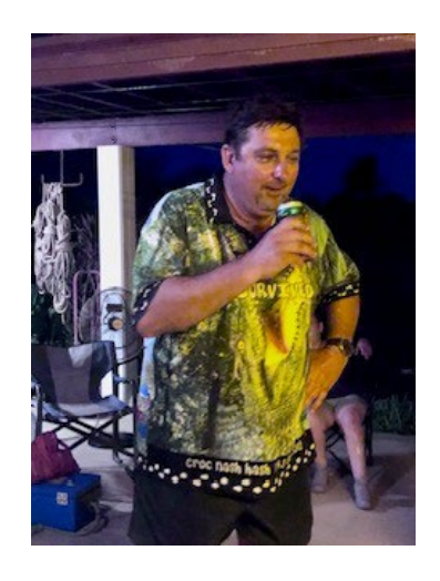
Tow job on the dob