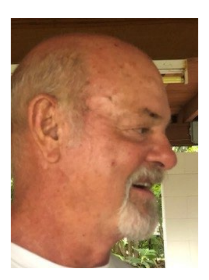
Another mug shot