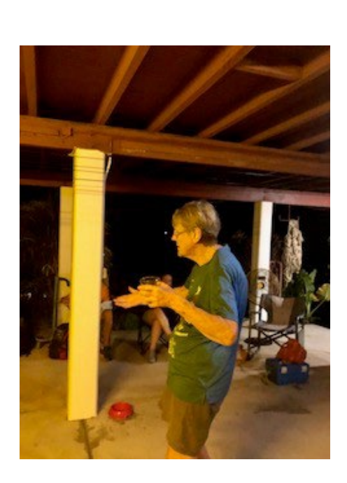
Ooops in action