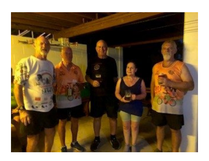
Returners & visitors