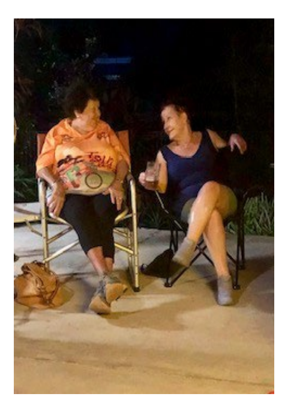
Yak Yak Yakity Yak – she back HJ