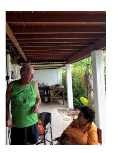
Obe n Guest