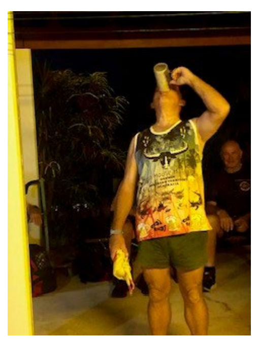
Down down HIV claims the chook for flossing