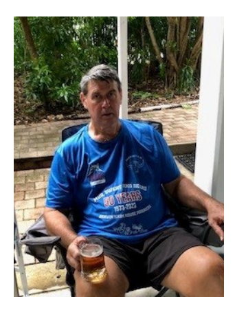
Sitting and sipping