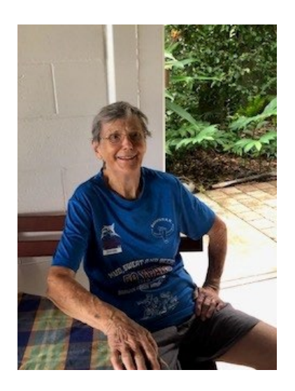
And the Hare - waiting for a double malt