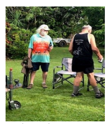
Monkey n Obe setting up camp