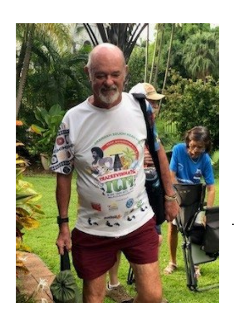
Physio arrived early – left early too