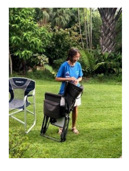
Gotta get the chair set up