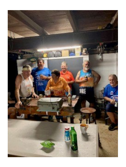
A Trio of Hares