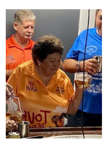
Mnn – not bad