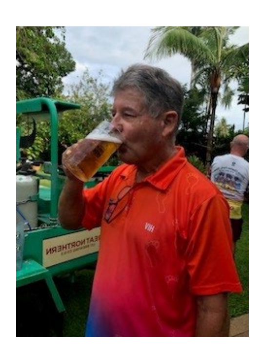
Testing 1 2 3