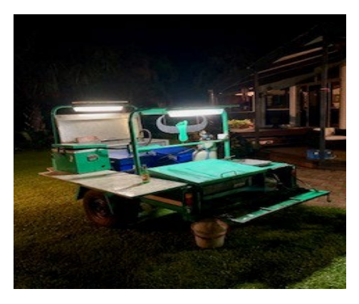
Our green beer machine