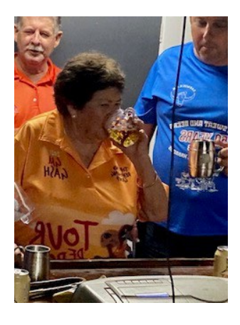
Definitely not champers