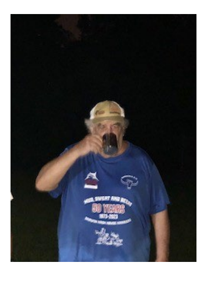
Animal well pleased with himself