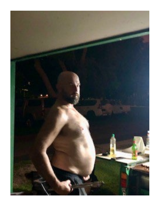
Before you I ask I think its his hand