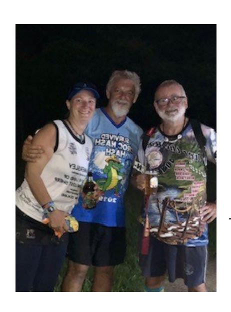
Bubbles GM & Skiddy