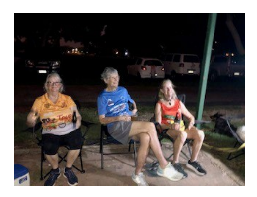
Some of the ladies