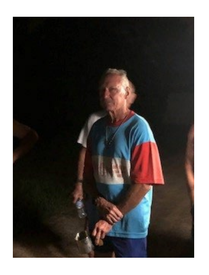
Gropa – The Hare with a Physio shadow