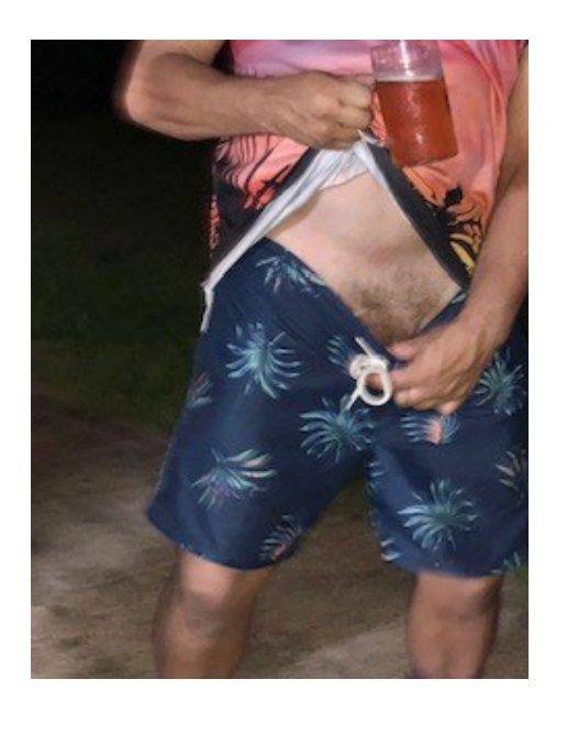
He swore blue they were red