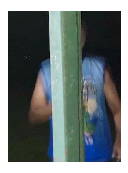
Best view GM