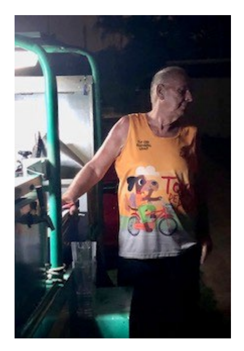
Scribe lends an ear