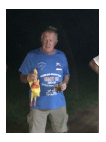
Chook stays put