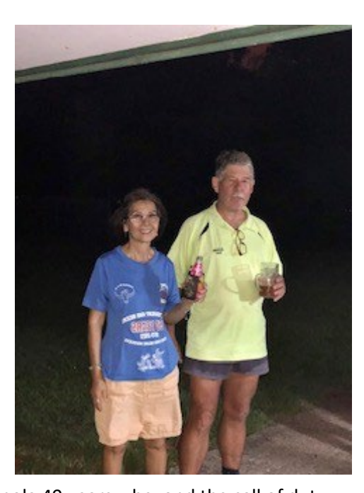
Enola 40 years – beyond the call of duty