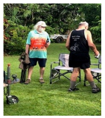
Monkey n Obe setting up camp