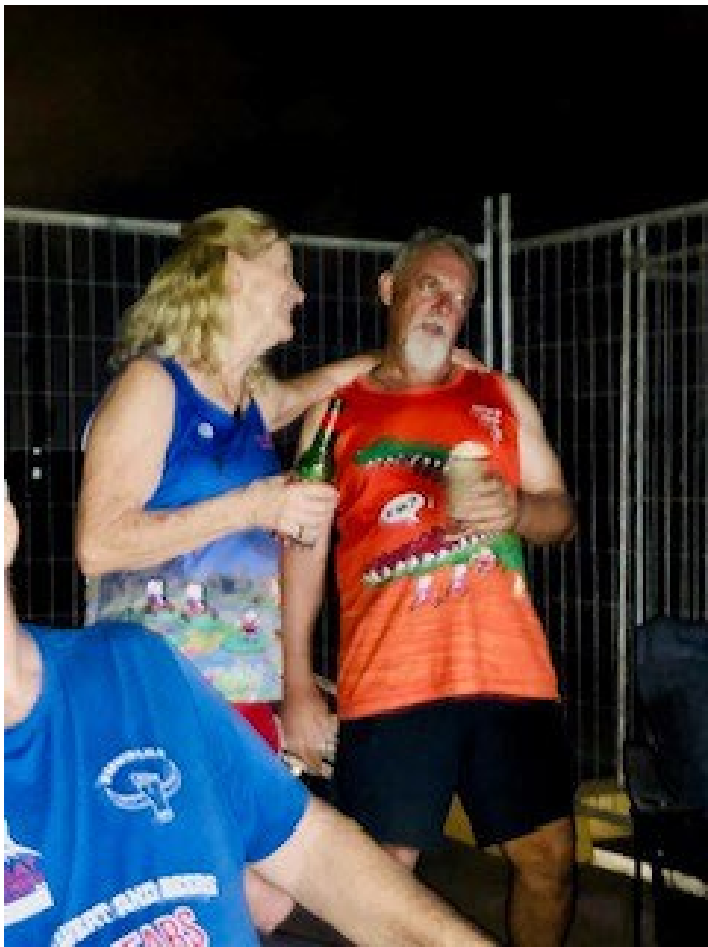
Looking weirdly spasso – maybe a bright idea looming