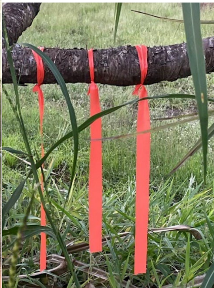
False trail – go back