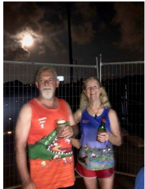
Hares for the night-