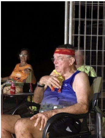
Oh what a feeling – chook f..er