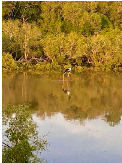
Jabiru -incoming tide feeding time