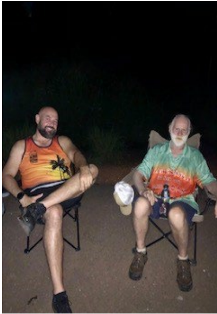
TTB & Monkey