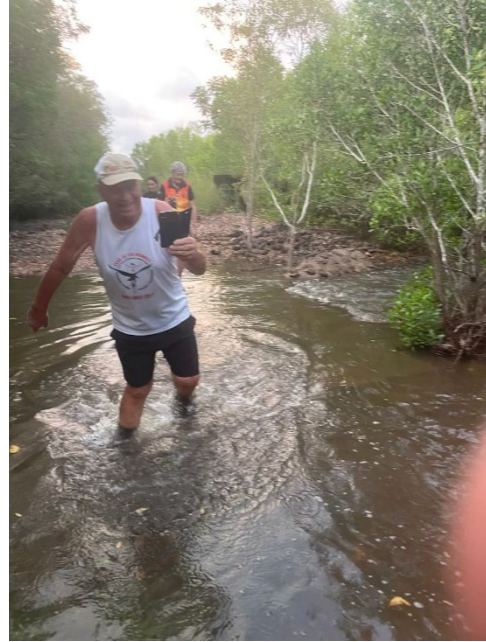
Obe takes the plunge