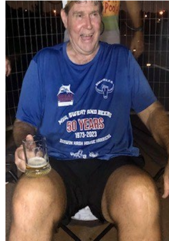
Pickles on ice- talking when he