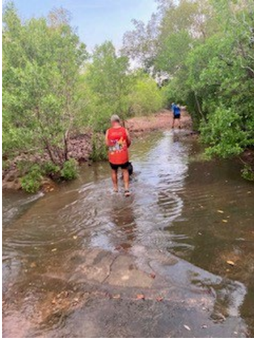
GM Looking please – Wet shoes following