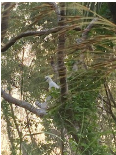
Cockies being cocky