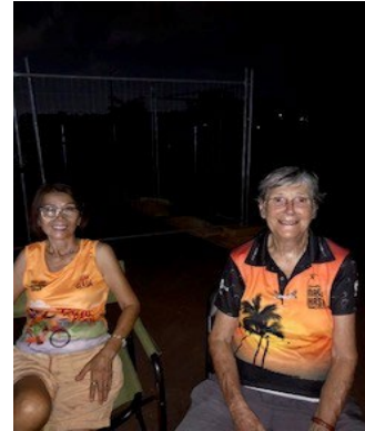
Two of our lovlies