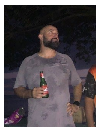
The Hare takes his note