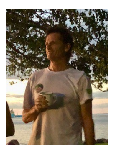
The Defector in his glory