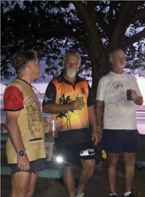
The three stooges