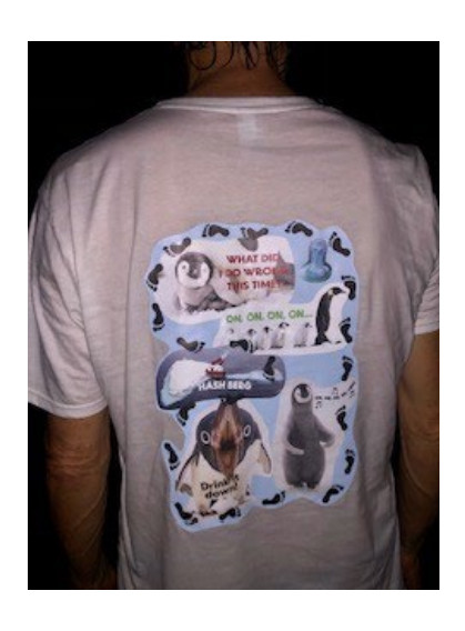
Ice Penis Fuck Up