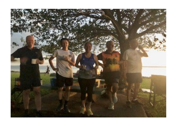
Returners Grassy Knoll and Whatshisname