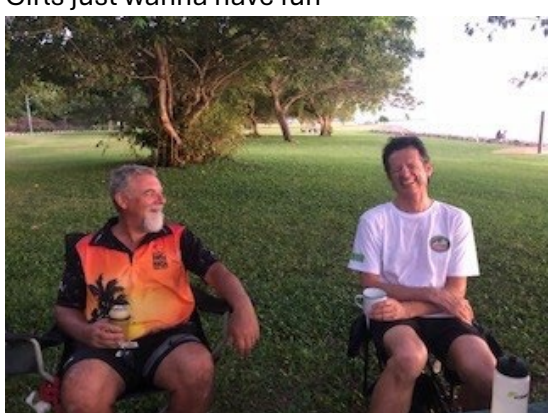
The Rural Defector