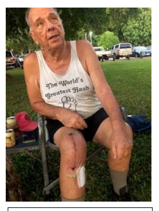
Obe no longer kneedy