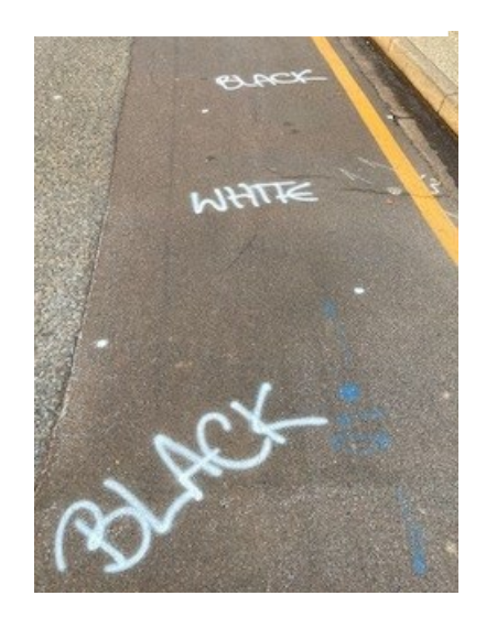
The great divide