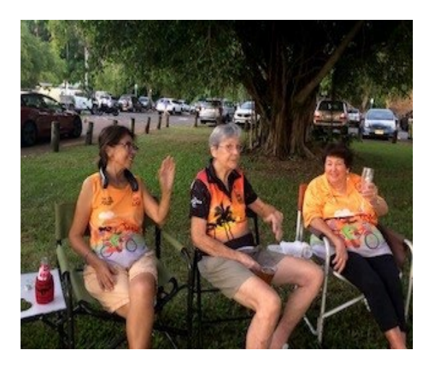
Girls just wanna have fun