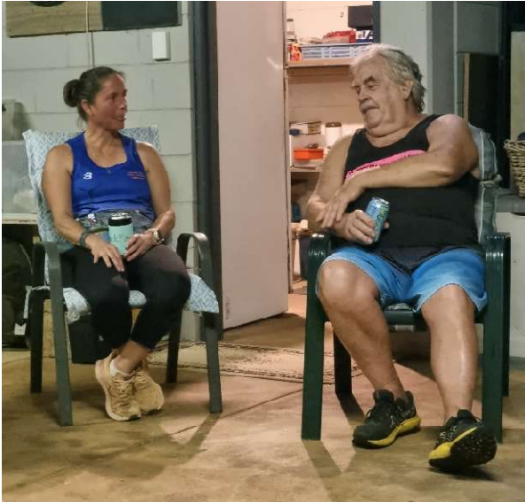
Theres a Chair in There