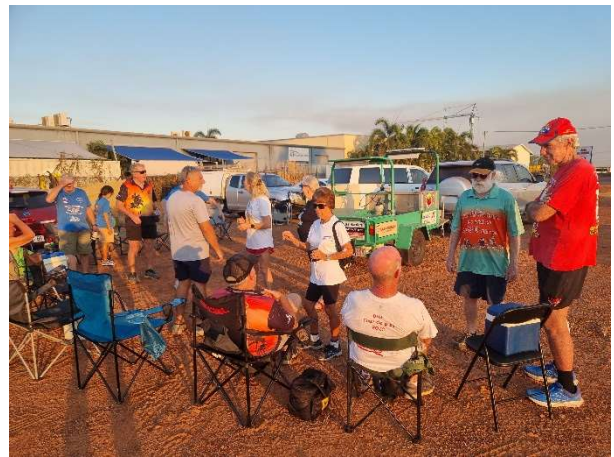
Darwin Hash Jun24