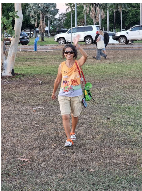
Enola Sprinting to the Finish

The hare said it was a short maybe 4K run on white chalk & orange tape. So we took off across the road in the direction indicated by the hare. Then we all stood around like stunned mullet looking for trail until the hare arrived and pointed and said "That way you dumb cu..ts."