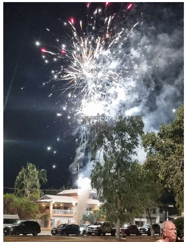
Bloody Noisy Neighbours

If I win the lottery nobody around me will be broke, and I truly mean that. I will move to a wealthy neighbourhood.