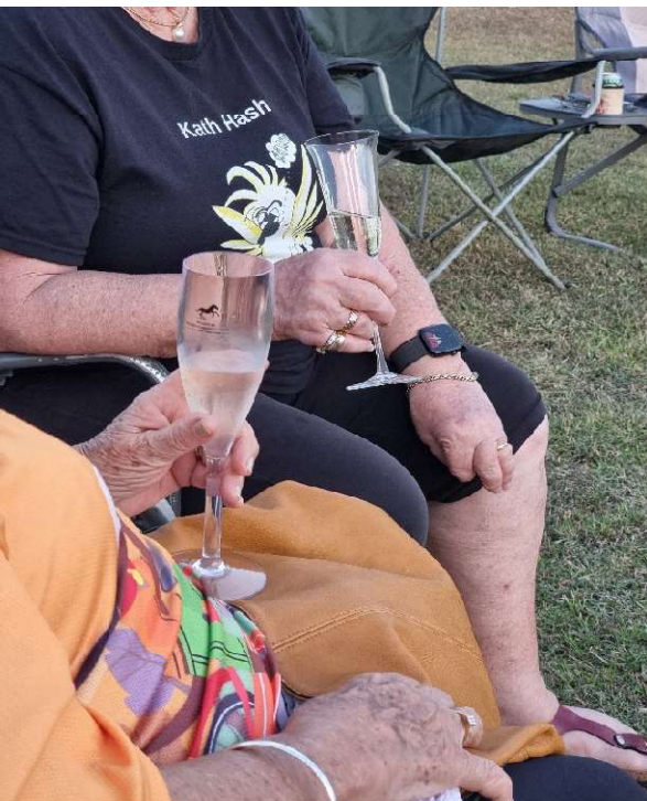
The Bubbles are a Popping

If I win the lottery nobody around me will be broke, and I truly mean that. I will move to a wealthy neighbourhood.