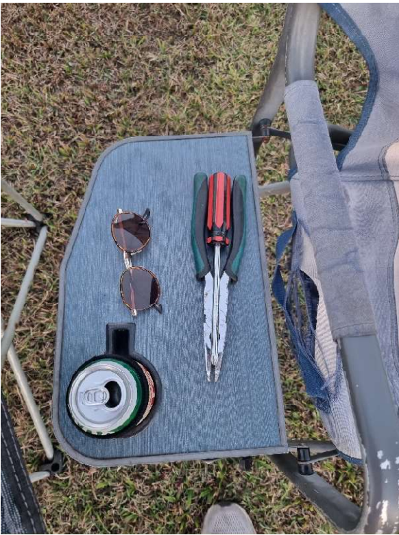
OBE's Dentistry Set