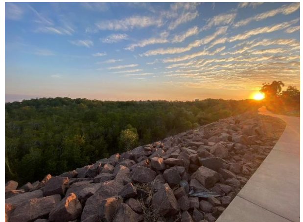
Houdini's disappearing sun. If only the midgies would vanish!