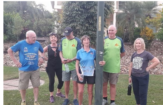
Some of the walkers