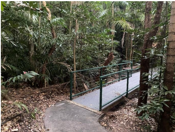
The boardwalk and stairs are fixed from the rotten wooden ones we always hopped over.