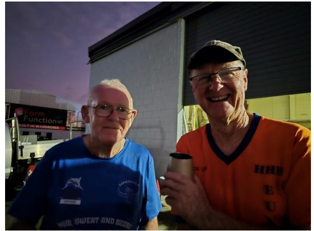
Rocketman & Cock Up