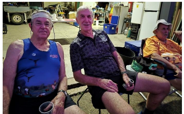
Barbwire containing the hare