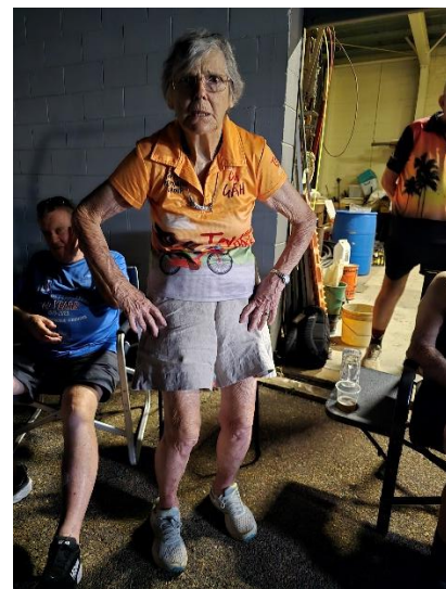
"Houdini??" says Oops

Oops wanted to fine the hare for the bent arrows, however Houdini was present and it got lost in the circle and the fine vanished.