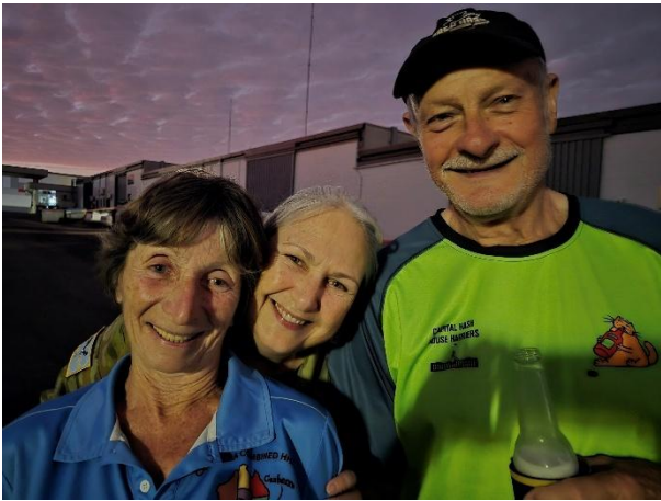
The Band is back together! Babbling, PP & Partie Pie