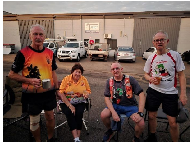
Guest the jewel entertaining