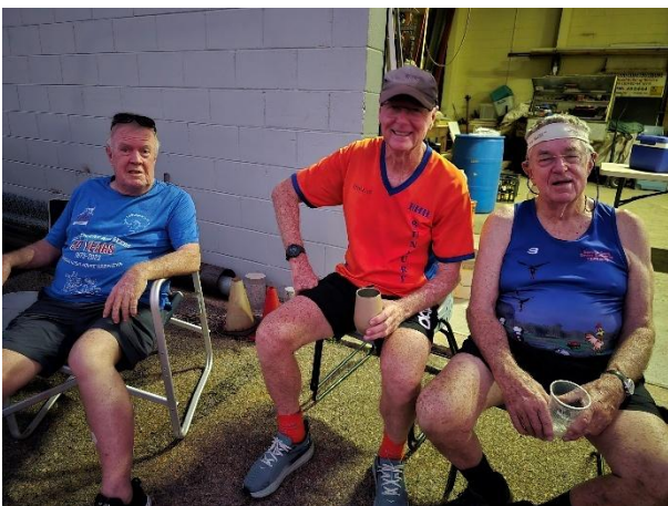
Evidence of Concrete Boots