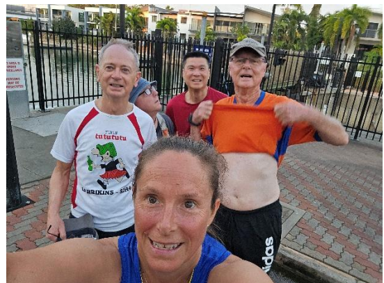
Where are my Sunnies? Runners at Bayview Lock