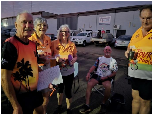
Staples On On!