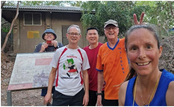
Running from Explosives Storage relic