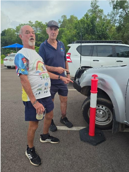
No go zone marked out