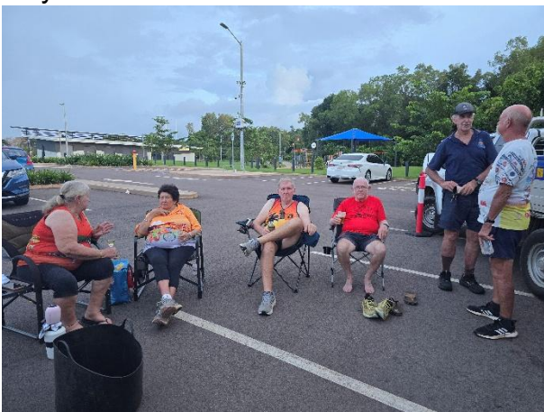
Half the mob