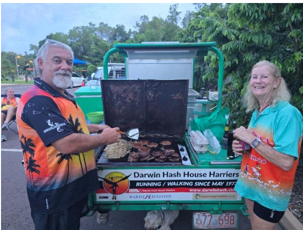
Chefs at work