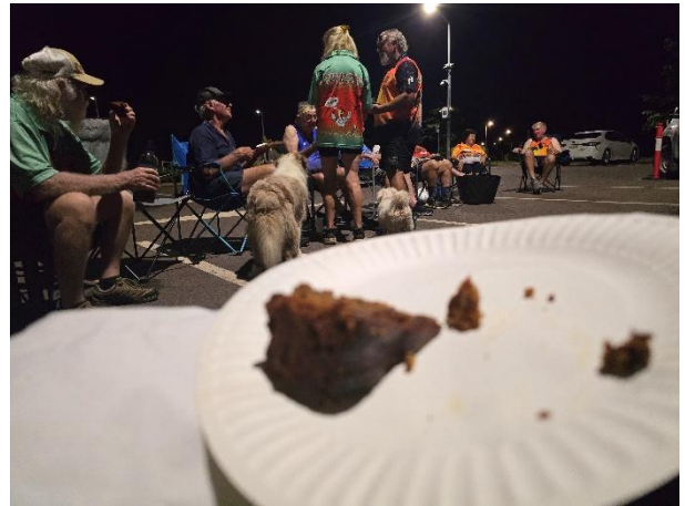
Deserted or desserted?