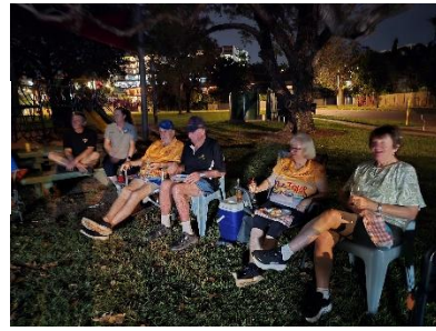
Virgins & gifts