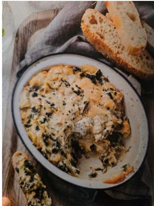
Spinach and Artichoke Dip