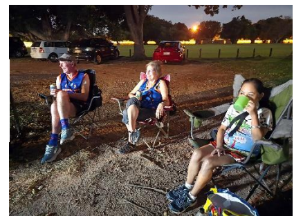
Cock Up cracking up