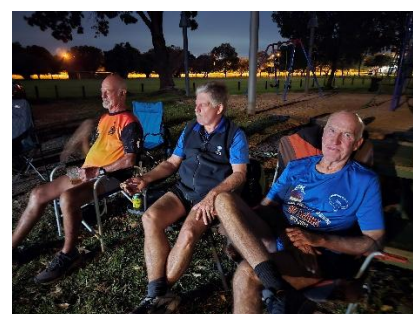
Woodchip scheming the next plot