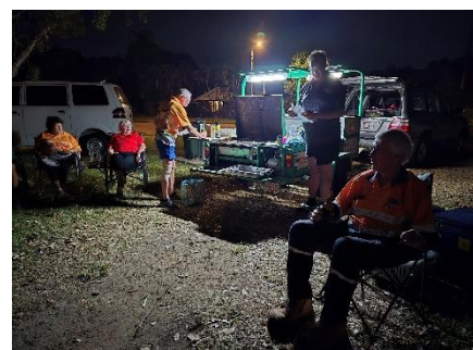
Choir Master & GM concockisions