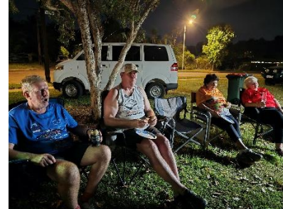
Gash “Ohh What a Feeling”!