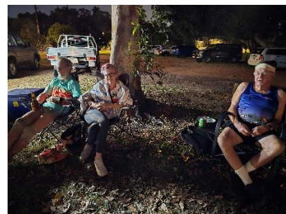
The Barbwire effect