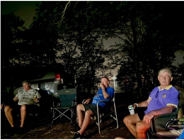
Lighten Up the sky