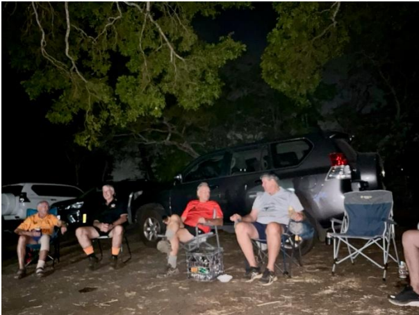
Hold on.....picnic at hanging rock