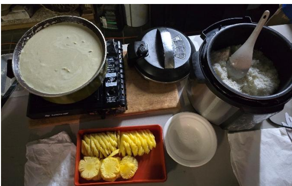
Green chicken curry, rice & sweet home grown Enola's pineapple

Thanks Enola for helping with rice and growing a delicious pineapple!