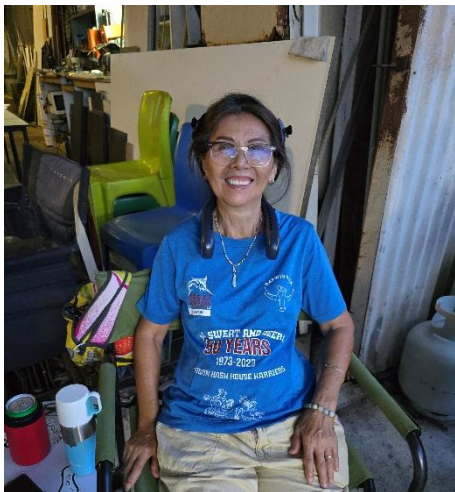
I SCREAM cheeseCAKe!