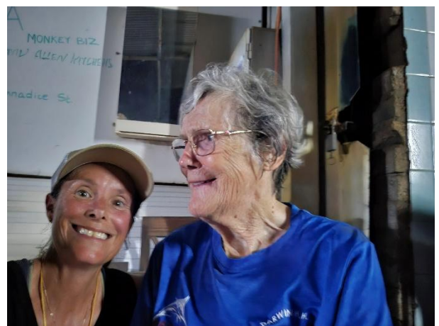
Eye, what's over there?