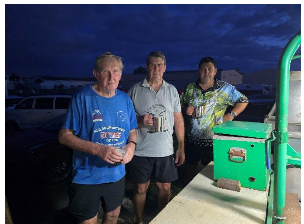
The boys, and the keg is pouring beautifully