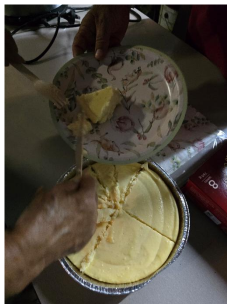
Cake, everyone loves cake