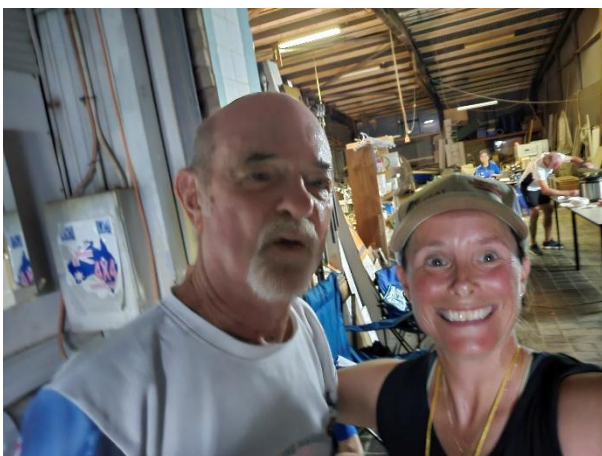
Scribe is back!