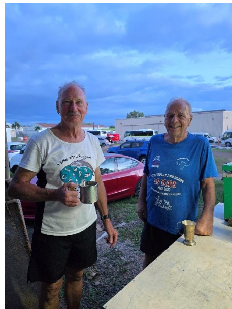
And the keg is pouring beautifully