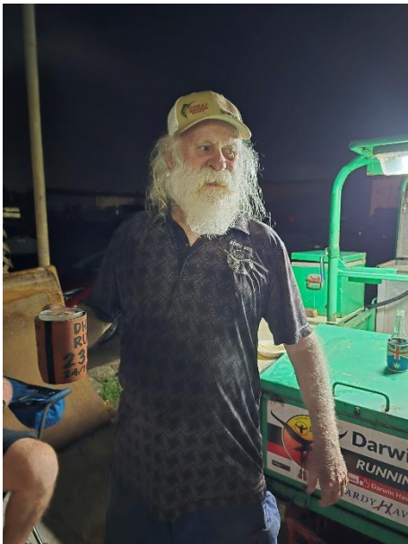
Monkey is back!