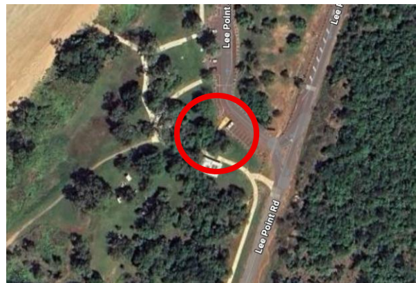
Lee Point rotunda