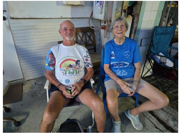
Saint Physio & Oops happy to see scribe turn up! THANKS Saint Physio for backing up last week