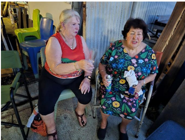
Bubbly wubbly Guest