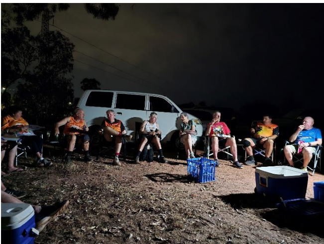
Half the hash pack