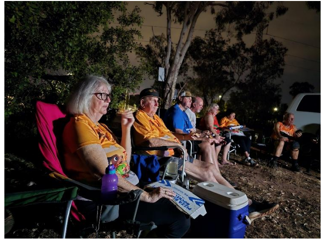
The other half