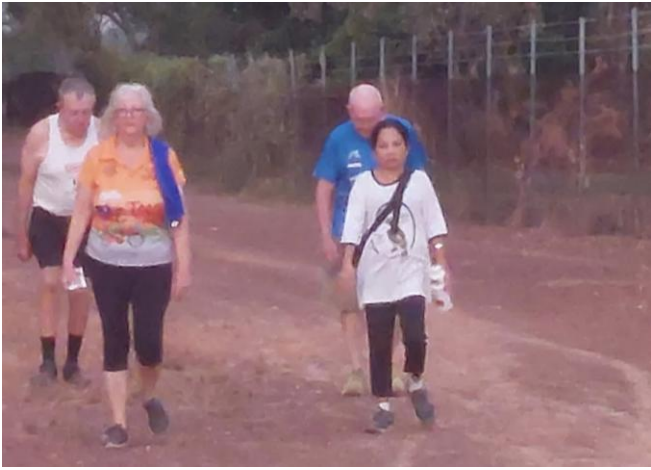
Barbwire, Dibba Dobba, Rocketman & Chilli Bush trying to break out