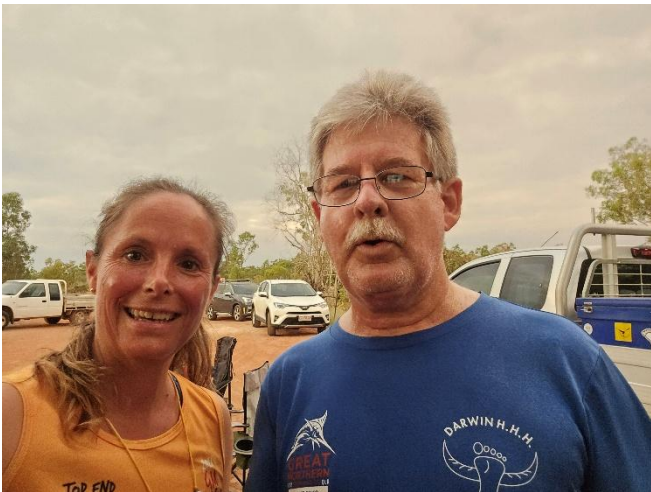
BackPage & HIV catching a breath after run