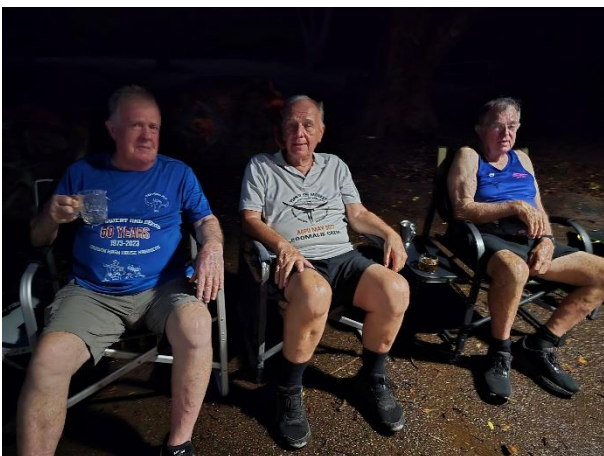
These Boots are made for walking!