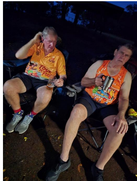
Hmm, Gash got the scratch