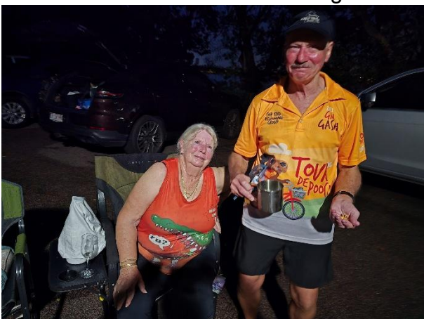
It's the best!