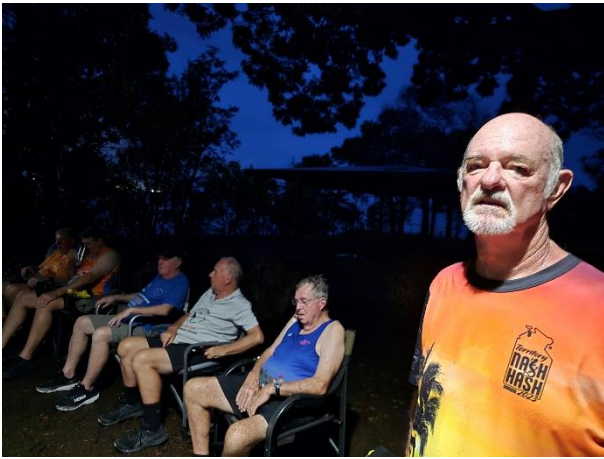
Saint Physio disgusted at HIV pusser thoughts