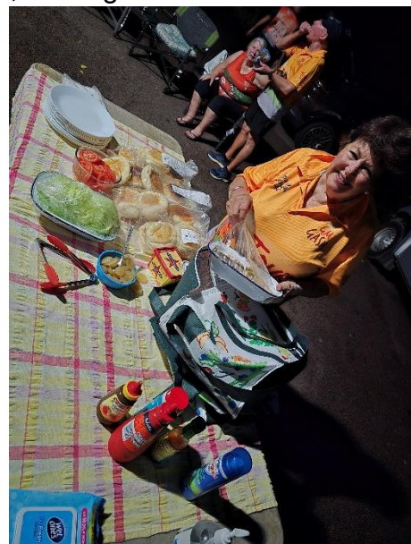
Guest prepping nosh!