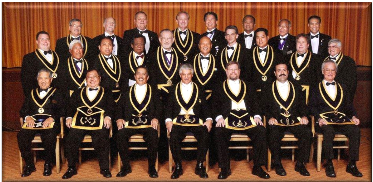
Grand Lodge Officer 2010 - 2011