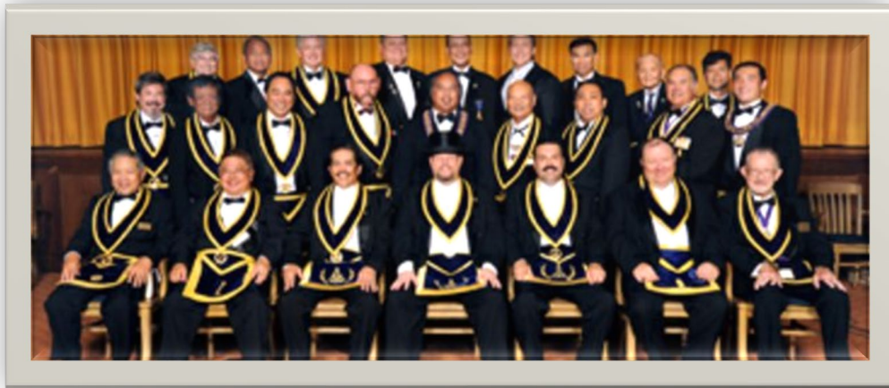
Grand Lodge Officers 2011 - 2012