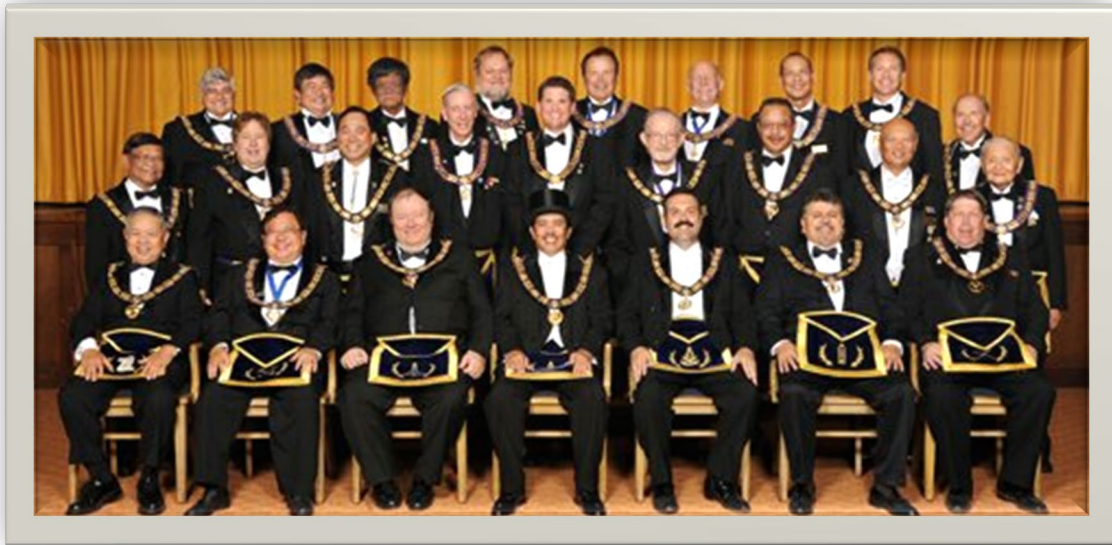
Grand Lodge Officers 2012 - 2013