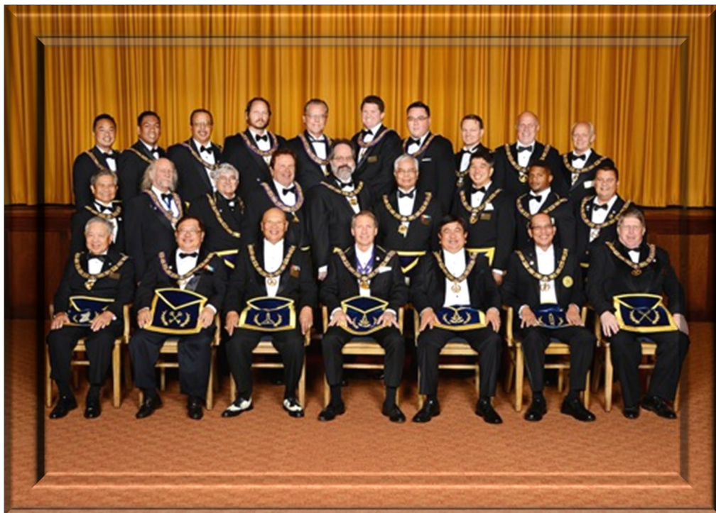
Grand Lodge Officers 2016 - 2017