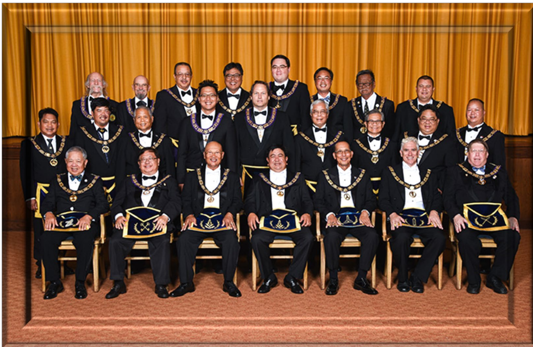
Grand Lodge Officers 2017 - 2018