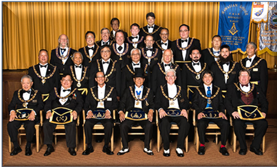
Grand Lodge Officers 2018 - 2019