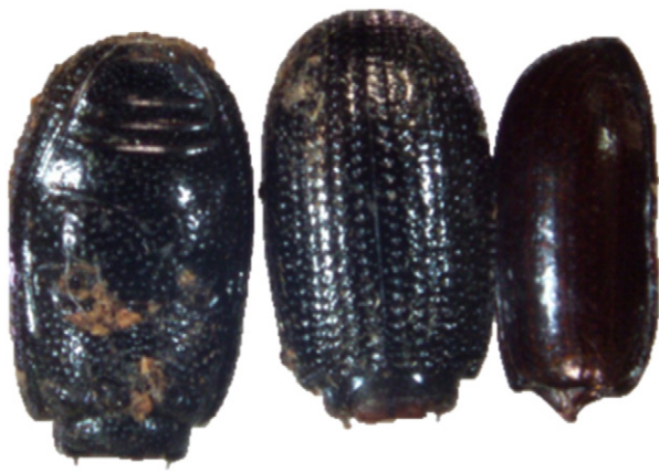
Fig. 4. Spider beetle remains (Coleoptera: Ptinidae) from de' Medici embalming jars.

decomposition up to, and in the case of the spider beetles, including decomposition of dried tissues. Third, just as the absence of blow flies tells us that the contents of the embalming jars were not “fresh” tissue (which would have been attractive to early stage decomposers), so too does the absence of another species tell us that old, dry tissues were not accessible to insects. The most common and ubiquitous insect group associated with decomposition of dried tissues, hair, and skin is the hide or larder beetles, the dermestids (Coleoptera: Dermestidae). If contents of the embalming jars had been left open for an extended length of time (many months), then it would have been inevitable that once all materials became completely dry, dermestid adults and larvae would have infested those jars. Consequently, it is almost certain that jars were not accessible to arthropods for an extended period of time.