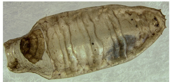
Fig. 2. Puparium belonging to a coffin fly, Conicera tibialis (Diptera: Phoridae) from a Medici embalming jar.

These analyses provide additional data regarding the corpocenos as related to historic human remains in Italy. The assemblage of insects