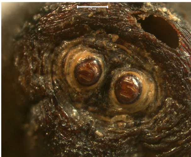
Fig. 1. Posterior spiracles of a puparium of Hydrotaea capensis (Diptera: Muscidae) from a Medici embalming jar. Scale = 0.2 mm.

The location of different insect species by jar and a knowledge of insect biology allows us to interpret our findings relative to embalming and decomposition. First, none of the jars showed any evidence of species associated with early decomposition, and, in particular, no blow fly (Diptera: Calliphoridae) remains were discovered. Typically, the calliphorids are the first insect species to arrive at a dead body, but they are not typically associated with later stage decomposition, particularly after soft tissues have decomposed. Second, all of the arthropod species recovered in this analysis are associated with mid to late stage