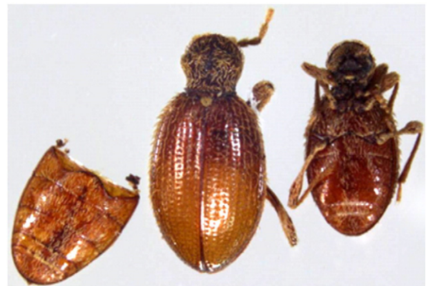
Fig. 3. Spider beetle remains (Coleoptera: Ptinidae) from Medici embalming jars.