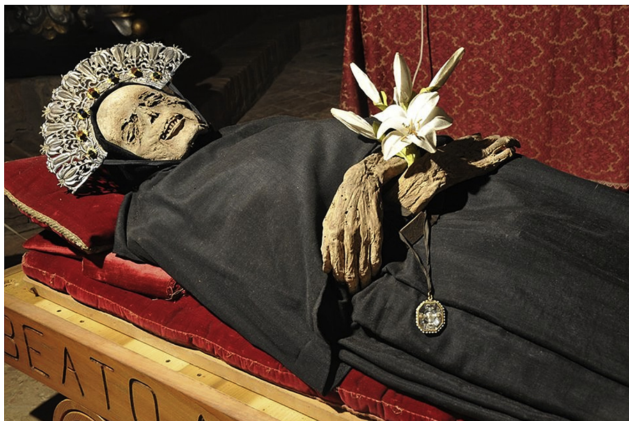
Fig. 1. The Blessed Antonio Patrizi da Monticiano.

At the time of corporeal inspection, we discovered a non-uniform distribution of puparia. The distribution was overwhelmingly gravity-dependent with the posterior surface of the body. Only a few puparia were scattered at other parts of the body. It could be that seepage of fluids to the posterior created an attractive environment