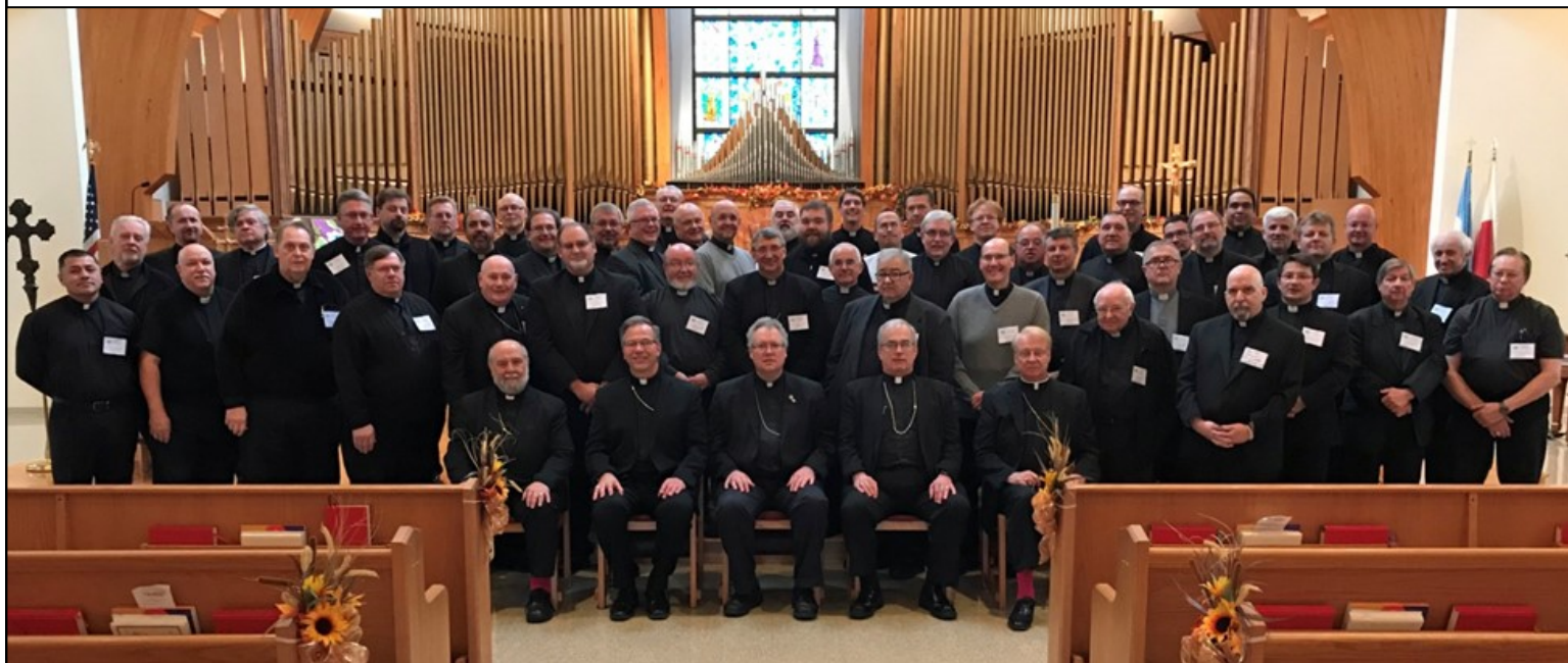
The PNCC Clergy gathered on the National Clergy Conference at the Holy Mother of the Rosary Cathedral in Lancaster, NY