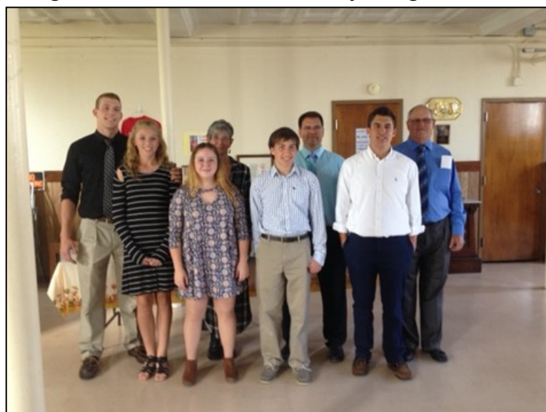
The four confirmation students and their sponsors.