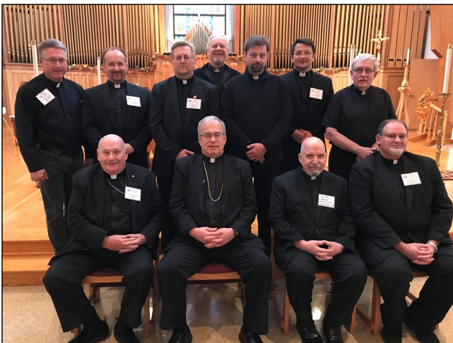
The Eastern Diocese Clergy at the National Clergy Conference

In the following two days several reports were given to the clergy: The National Liturgical Commission, Future Direction, 2018-General Synod, Sacred Vocation, Scouting, National School of Christian Living, Doctrine Commission, Ecumenical items: PNCC-RC Dialogue, Anglican Dialogue, Union of Scranton, Nordic Catholic Church, Ecumenism, Clergy Salary and Benefits, Social Media, Polish National Union of America, Financial matters of the Church, and Convo 2018.