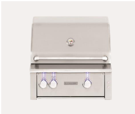
30" ALTURI ALT30T-NG / LP