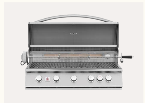
40" SIZZLER SIZ40-NG / LP