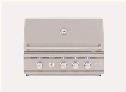
32" TRL TRL32-NG / LP