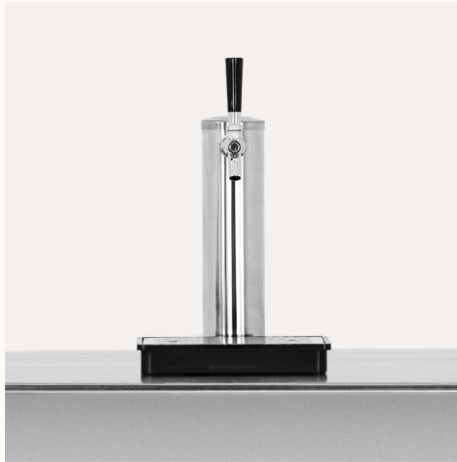
SINGLE KEG TAP FOR KEGERATOR