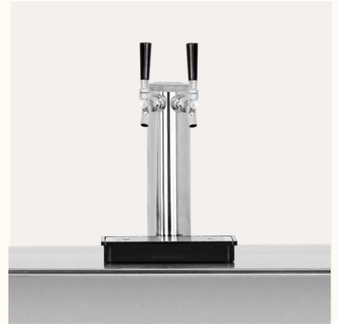
DOUBLE KEG TAP FOR KEGERATOR