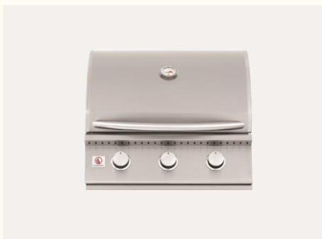
26" SIZZLER SIZ26-NG / LP