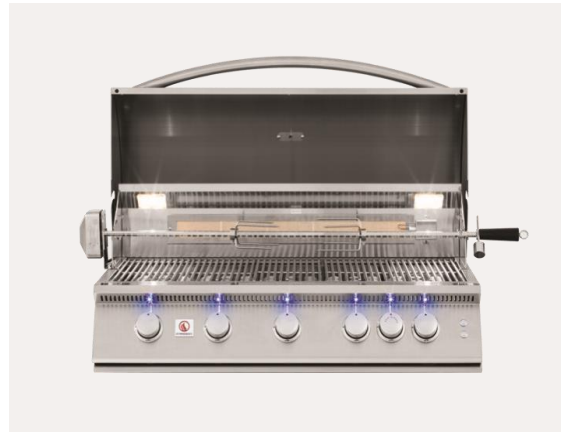
40" SIZZLER PRO SIZPRO40-NG / LP