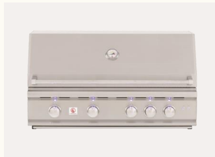
38" TRL TRL38-NG / LP