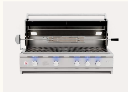
44" TRL DELUXE TRLD44-NG / LP