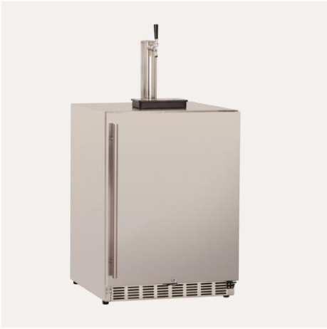
24" 6.6C DELUXE OUTDOOR RATED KEGERATOR (NO TAP / SINGLE TAP / DOUBLE TAP)