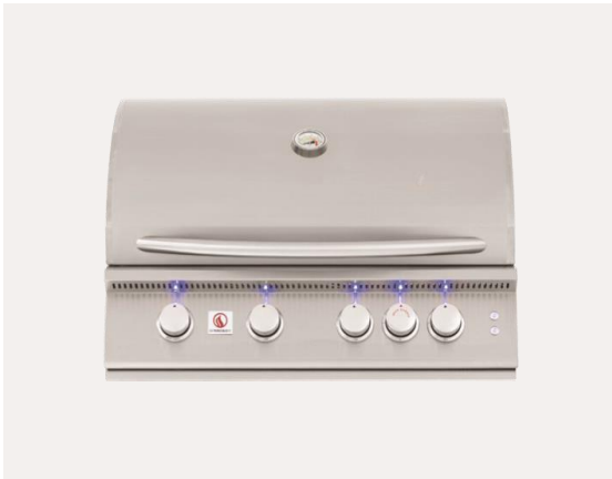
32" SIZZLER PRO SIZPRO32-NG / LP