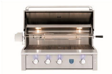
42" ESTATE GRILL