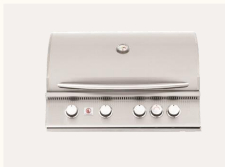
32" SIZZLER SIZ32-NG / LP