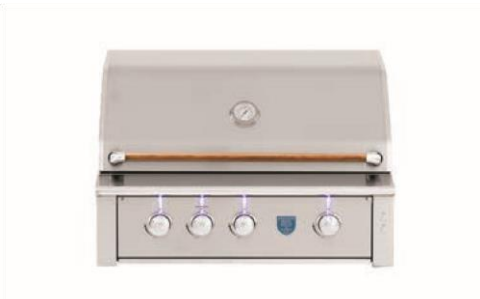
36" ESTATE GRILL