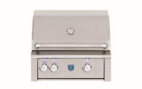
30" ESTATE GRILL

The Estate Grill is a luxury gas grill series that is designed and built entirely in the USA. » #304 Stainless Steel