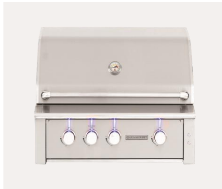
36" ALTURI ALT36T-NG / LP