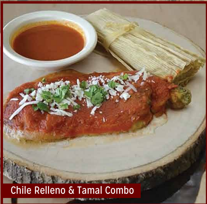
Chile Relleno & Tamal Combo