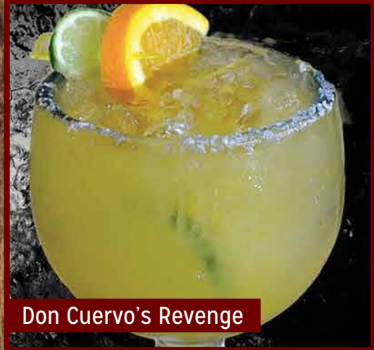
Don Cuervo's Revenge

White Wine Robert Mondavi Chardonnay • Pinot Grigio White Zinfandel • Moscato