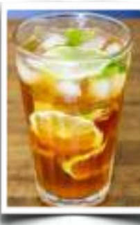
Shaken Iced Lemon Tea 7.00