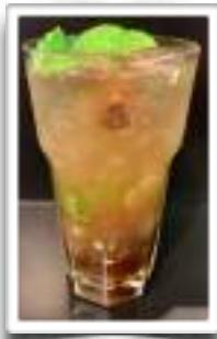
Asam Quencher 7.50