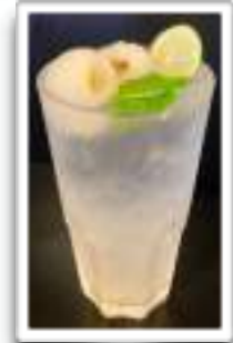
Lychee Virgin Mojito 10.00