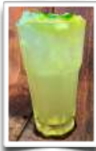
Apple & Lime Twist 9.50