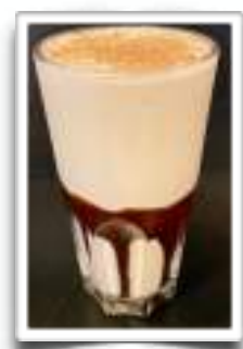
Nutella Milkshake 10.00