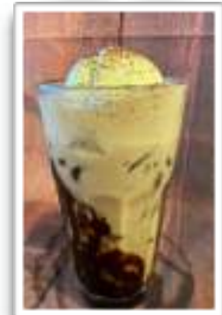
Shaken Iced Chocolate 9.00