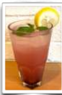
Raspberry Lemonade 9.00