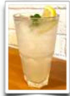
Citron Presse 8.00