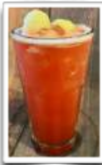
Watermelon Lychee 9.50