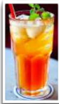
Shaken Iced Lychee Tea 9.50