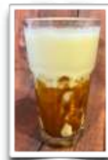
Salted Caramel Banana Smoothie 12.00