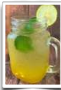
Mango & Lime Cooler 10.00