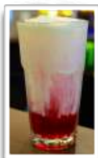
Sirap Bandung 9.00