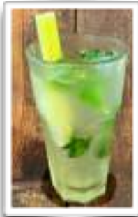
Shaken Serai Cooler 7.50