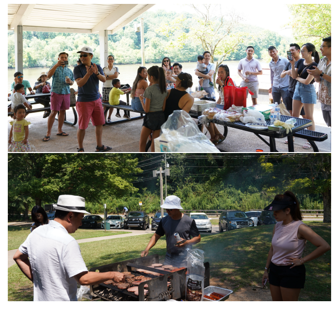
Thank you VAHPAG members & families who joined the Board members at VAhPAG annual summer picnic. Stay Cool!