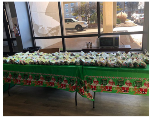
Women's shelter above and middle, men's shelter bottom & upper right.