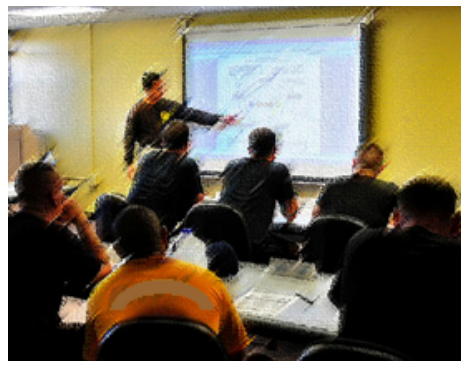
See Program Outcomes Pg 4 . . .

The program reaches beyond single moms to include men, older women, shelter residents and individuals in recovery