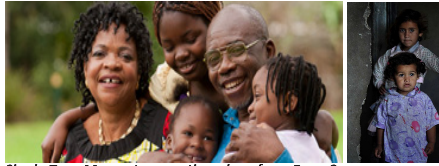
Single Teen Mom- story continued . . . from Page 2

"Time's up! Landlord shows up at 7am with the police and changed your locks. So now you're living in your car with your 7 year old son and everything you need to get by. You tried to get a storage unit, but you don't have a billing address so they won't sell one to you, so you could only take what would fit in your backseat. You pay to shower at local truck stops and eat whatever can be cooked in a gas station microwave. Someone sees you and your son living like this and calls CPS; guess what happens next. They remove your child from your care. As if this isn't devastating enough, you lose your job too, because "an employee losing their child reflects poorly on this company."