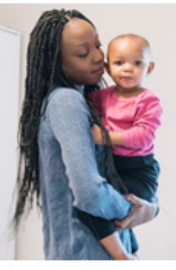
The SUCCESS Program focuses on improving knowledge in areas that promote positive lifemanagement skills for personal development, employment and selfsufficiency.