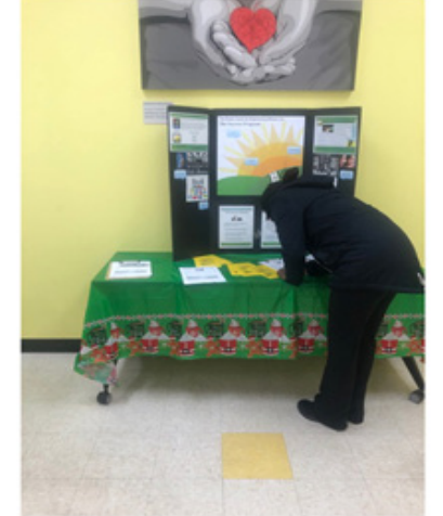
Residents take a look into The SUCCESS Program. NCEW is a 5013C non-profit.