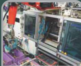
Plastic injection moulding