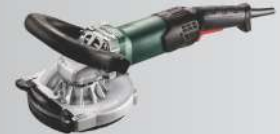
RSEV 19-125 RT (in Metaloc, no cup disc)