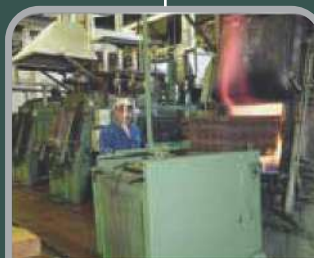
Steel parts with hardening plant