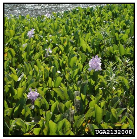
Water hyacinth, a target plant of the Pond Watchers.

How can you get involved? Familiarize yourself with one or more of the species on the target species list, keep your eyes on the water to look for those plants, and report what you find! You can get the details in the <u>Pond</u> <u>Watchers Handbook</u> and contact WIFDN at <u>WIFDNcoordinator@gmail.com</u> or (608) 262-9570 with any questions.