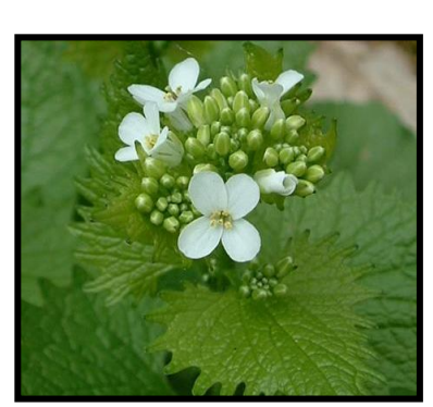
Second-year garlic mustard plant in flower.

We hope that you'll visit the site and take time to explore the information available. We also welcome any comments or suggestions on how we can improve this new site to make it most valuable for Door County residents and visitors. Our old website at <a href="http://map.co.door.wi.us/swcd/invasive/">http://map.co.door.wi.us/swcd/invasive/</a> will still be available, however it will no longer be updated with new information including newsletters, volunteer opportunities, or early detection species findings. All the documents and information that were available on the old website can also be found on our new website.