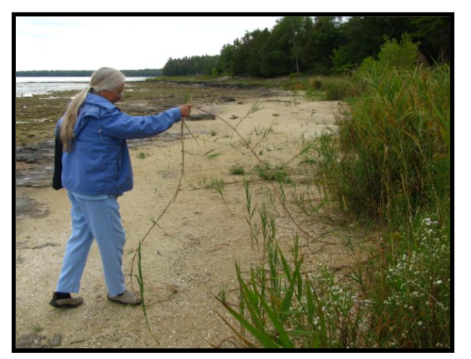
A volunteer in Jacksonport helps identify and map Phragmites.

With many of our local municipalities passing noxious weed ordinances that include Phragmites, DCIST now working with these Towns to implement control programs for this invasive grass. We are looking for volunteers to collect GPS inventories of Phragmites along Door County shorelines. Join us on June 22<sup>nd</sup> to learn to identify Phragmites and to receive training on our protocol for mapping this rapid invader. Those interested may check-out handheld GPS units (limited availability) to map their local shoreline areas during the month of July. DCIST will then compile the collected data to provide to the Towns in which Phragmites is found. Help us continue to eradicate Phragmites from Door County's shorelines! RSPV is not required, but appreciated - email <u>dcist1@gmail.com</u> or leave a message for us at (920) 746-5955.