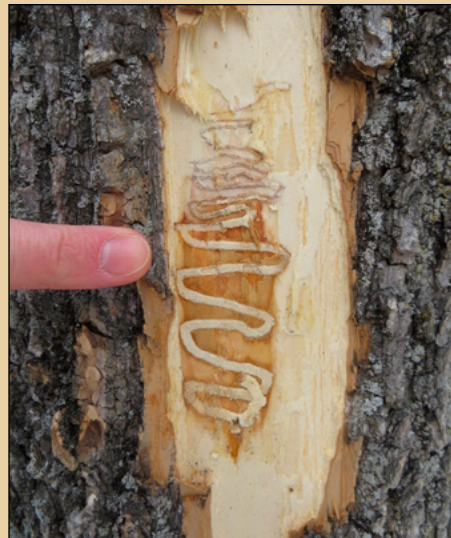
Figure 1. Winding galleries created by EAB larvae beneath the bark of an ash tree.

Adult beetle emergence begins in southern Wisconsin in late May. Populations may increase rapidly, as each female beetle lays between