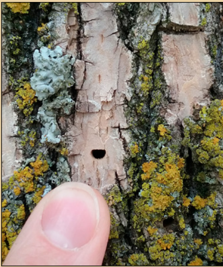
Figure 3. D-shaped exit hole.

Damage typically starts in the upper tree canopy and is light in intensity. Lightly-damaged ash usually have heavy damage within a few years, indicating imminent tree death.