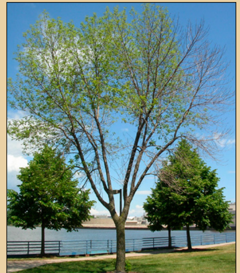
Figure 2. Characteristic thinning and dieback in an infested ash.

Emerald ash borer continues to be found at low levels after large ash trees in an area have died. EAB has been found in trees as small as one inch in diameter and will infest small ash as they grow larger.